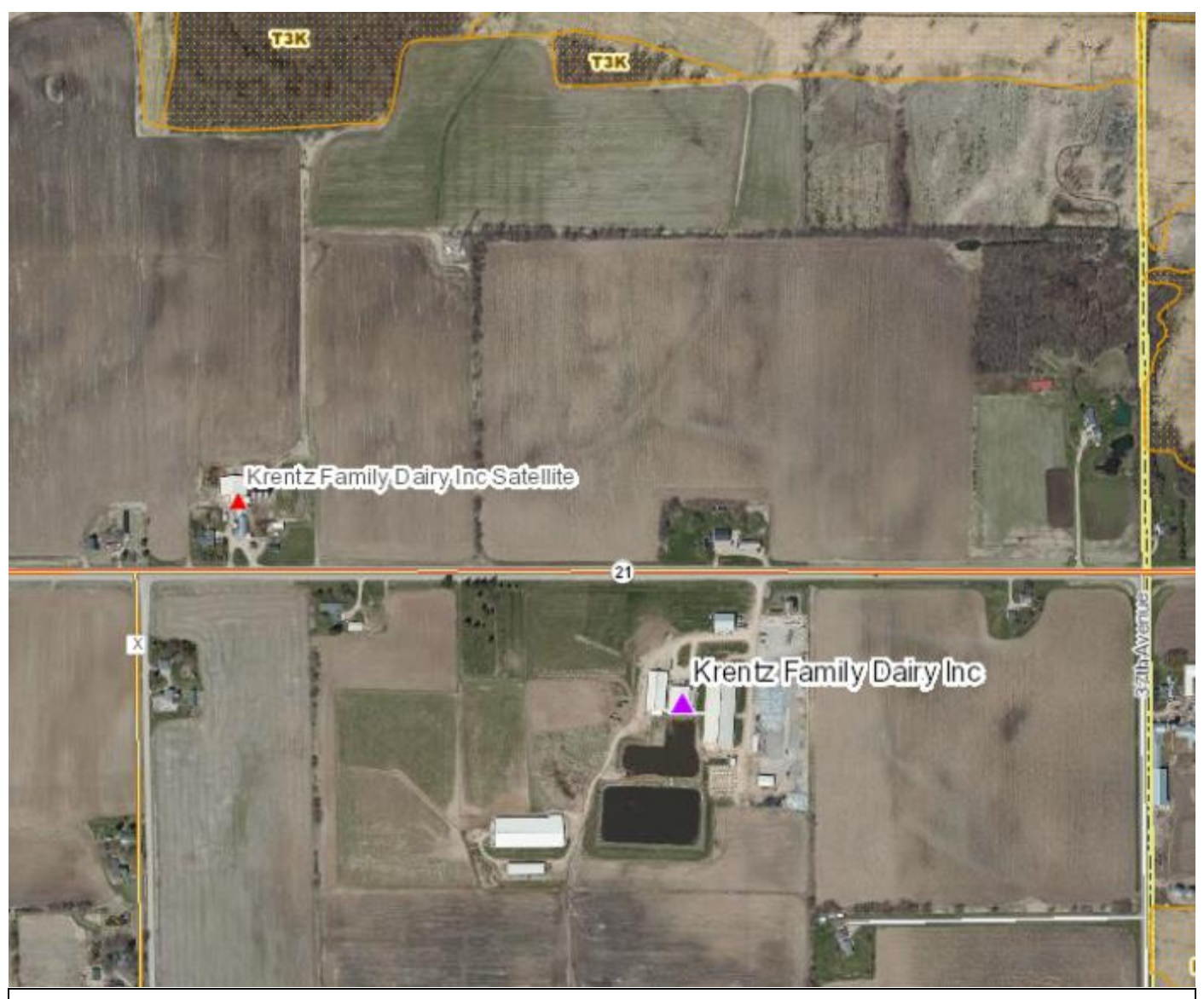
Figure 3. Aerial overview of Krentz Family Dairy in relation to surface water features. Yellow areas represent designated wetlands.