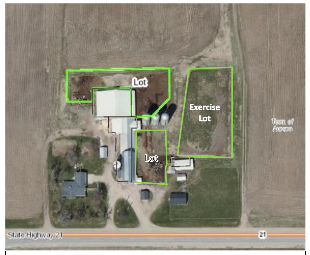
Figure 2. Aerial overview of Krentz Family Dairy Main, Dad's Farm site. Yellow arrows indicate approximate contaminated runoff flow paths, pink arrows indicate manure transfer systems.