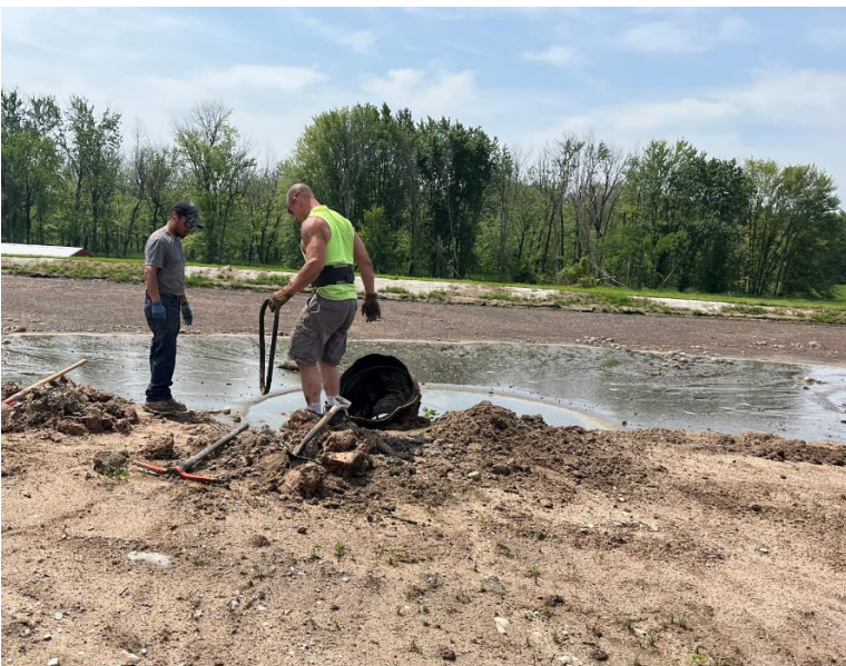
Photo 5: Workers actively repairing WSF 1 inlet pipe hole during the time of inspection.