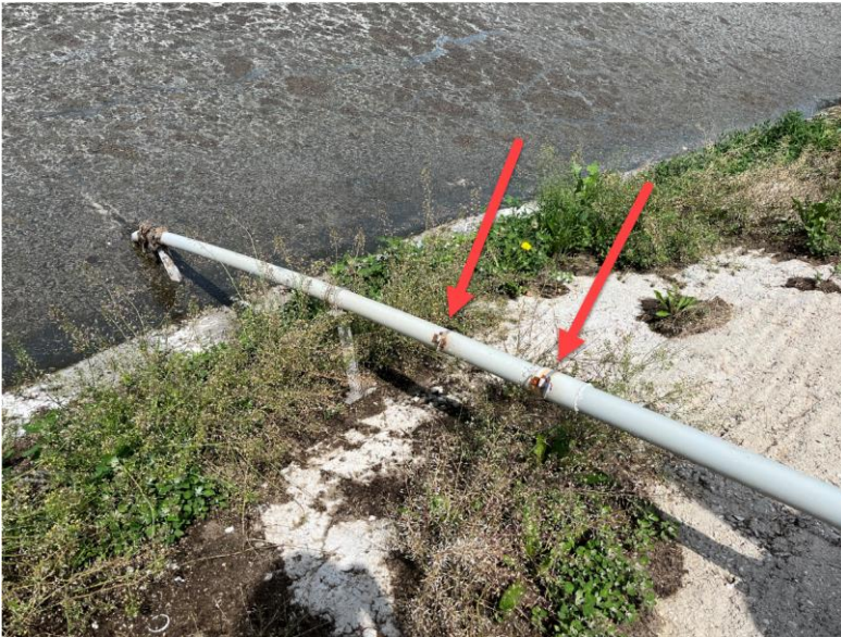
Photo 1: Permanent markers (red arrows) on conduit along the east side of WSF 3.