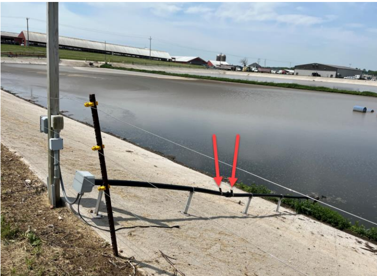
Photo 2: Permanent markers (red arrows) on conduit along the east side of WSF 4.