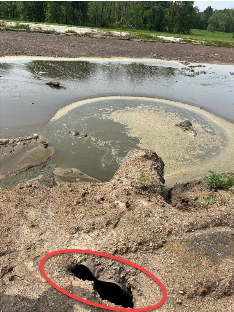
Photo 4: Hole in WSF 1 inlet pipe circled in red. Photo facing south.