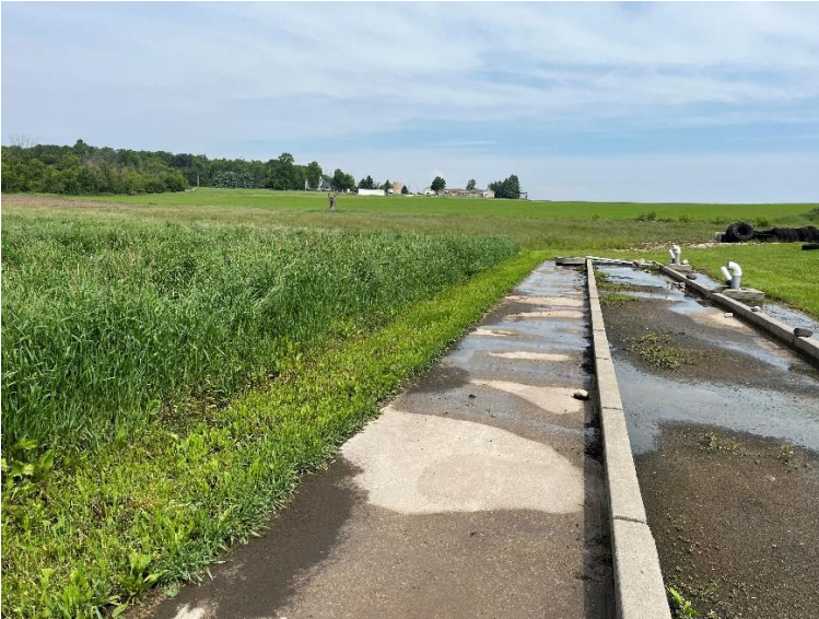
Photo 8: Looking north, process wastewater can be seen flowing from the concrete spreader bar into the VTA.