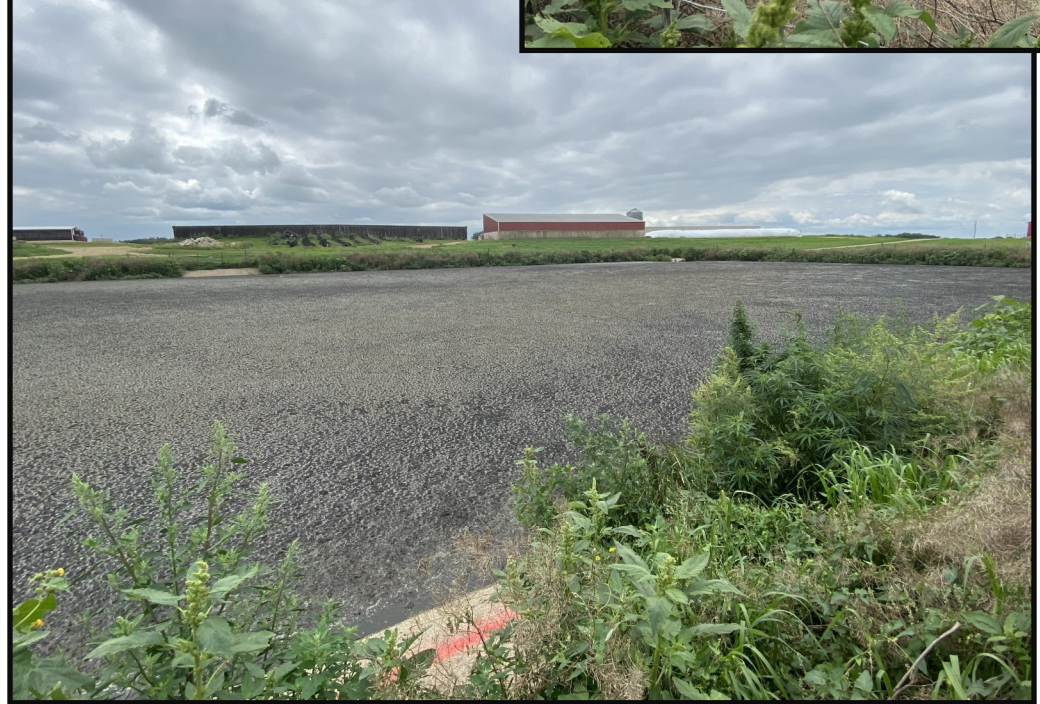
Photo 6 (Bottom Left): Looking south west across WSF 2. The permanent maximum operating level marker can be seen on the northern wall of the waste storage facility. A permanent margin of safety marker was not present in WSF 2.