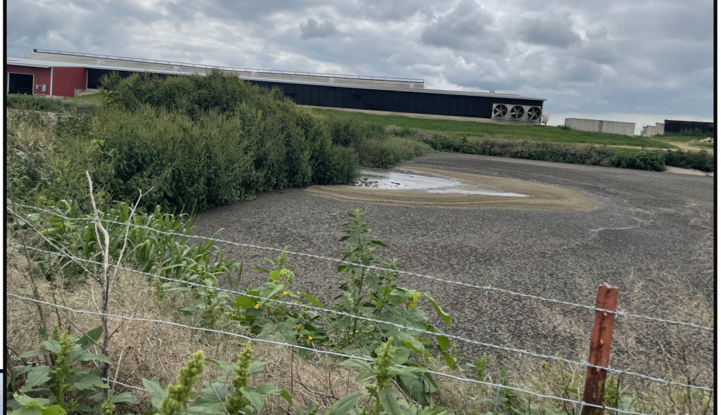
Photo 5 (Right): Looking south along the east end of WSF 2 toward the overflow channel where manure from WSF 1 flows into the waste storage facility. A safety fence was observed around the entire perimeter of WSF 2.