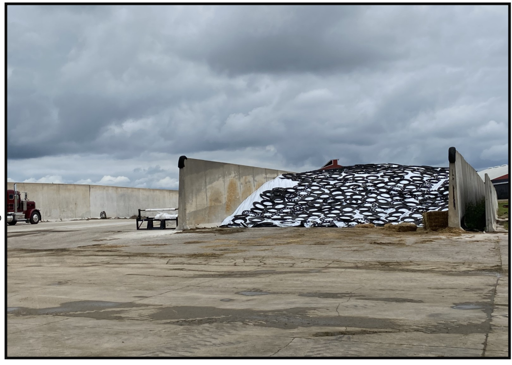
Photo 13 (Right): Looking east toward the eastern portion of the feed storage area from the center of the southern end of the feed storage. The eastern portion of the feed storage primarily slopes west toward the center of the feed storage area where leachate and feed storage runoff is directed to the runoff collection basin (pictured in photo 16).