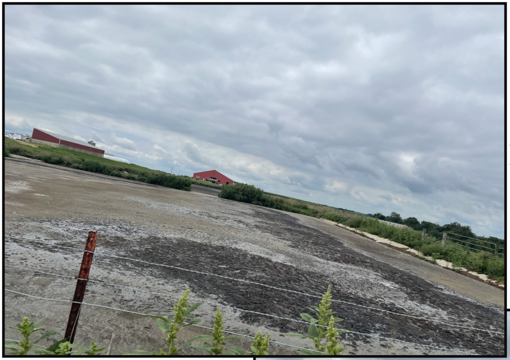
Photo 4 (Top Left): Looking west across WSF 1 toward the overflow channel where manure flows into WSF 2.

Photo 5 (Right): Looking south along the east end of WSF 2 toward the overflow channel where manure from WSF 1 flows into the waste storage facility. A safety fence was observed around the entire perimeter of WSF 2.