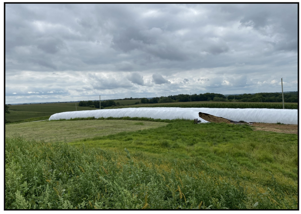
Photo 17 (Left): Looking south west at an area west of the feed storage area that is being used as one of the temporary feed storage areas for bagged feed.

The operation also utilizes feed bags to store haylage. If feed bags are not stored directly on the concrete feed storage area, the operation rotates among several areas where feed bags are temporarily stored on bare ground. An updated temporary feed storage area plan will need to be submitted as part of the permit reissuance application (see summary section for details).