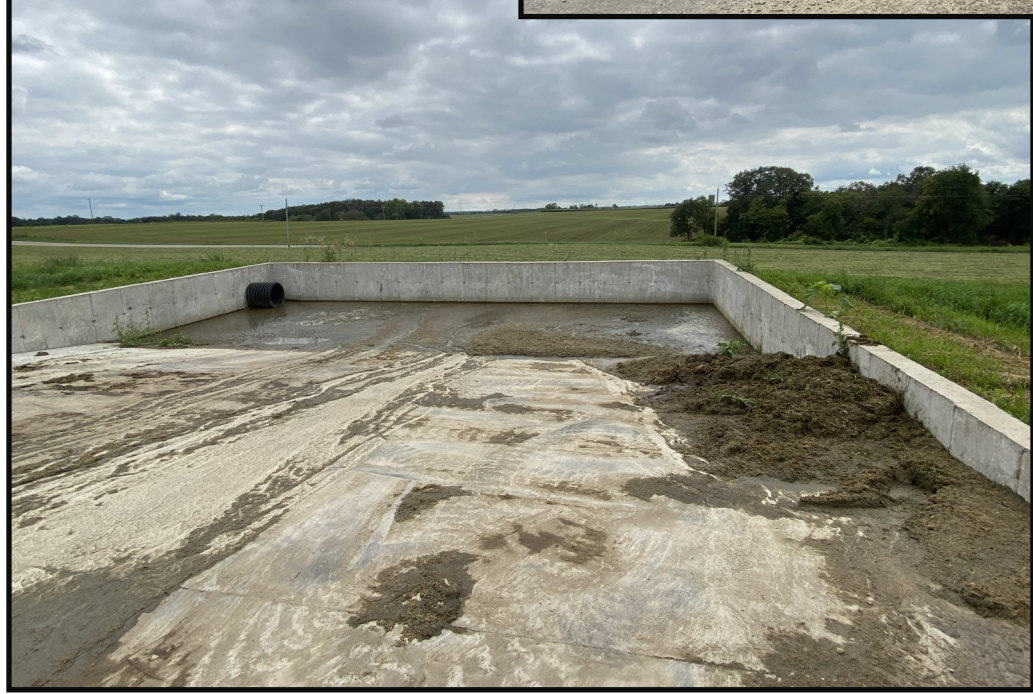
Photo 16 (Bottom Left): Looking south at the feed storage runoff collection basin located toward the center of the south end of the feed storage area. The contents of the runoff collection basin flow through the transfer system to WSF 3.