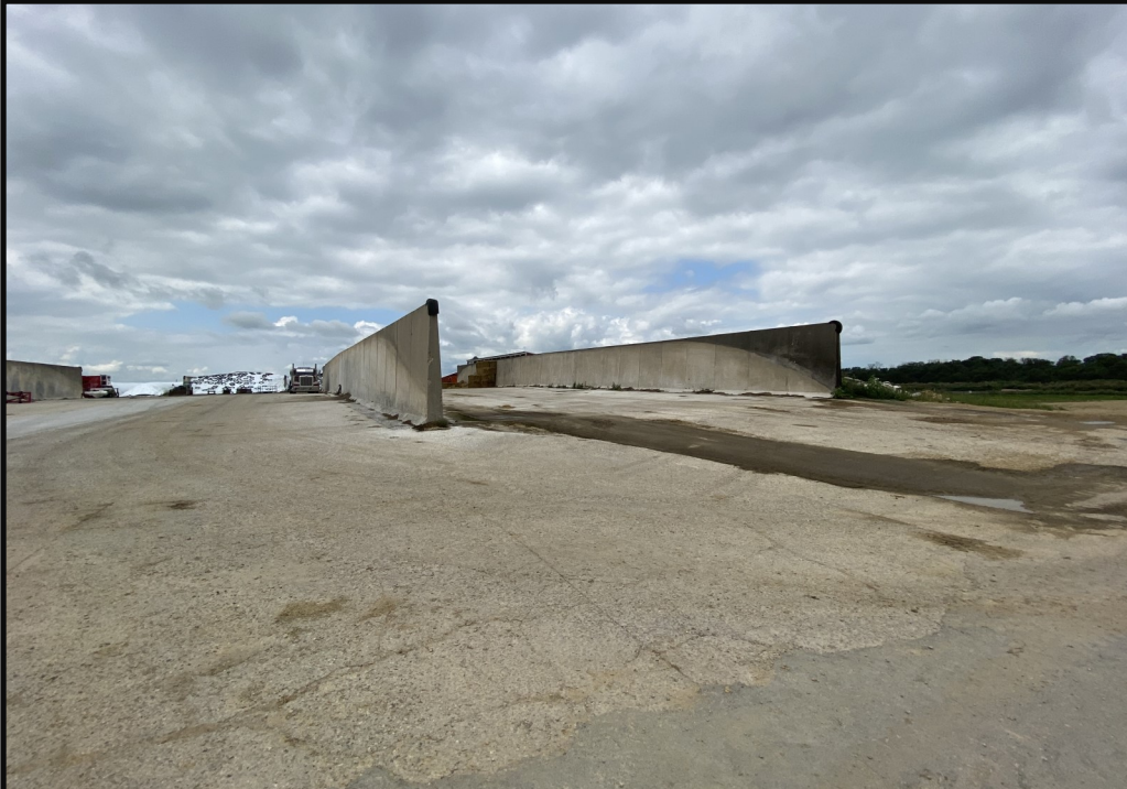
Photo 14 (Top Left): Looking west toward the east end of the feed storage area. Portions of the east end of the feed storage slope east away from the center of the feed storage area where leachate and feed storage runoff is directed to the runoff collection basin. Leachate and feed storage runoff that does not flow west toward the runoff collection basin flows east where it directly enters inlets to the runoff transfer system (pictured in photo 15).

Photo 15 (Right): Looking north along the east end of the feed storage area where inlets to the runoff transfer system are located. Leachate and feed storage runoff that enters the runoff collection basin or directly enters through the inlets to the runoff transfer system are transferred to WSF 3.