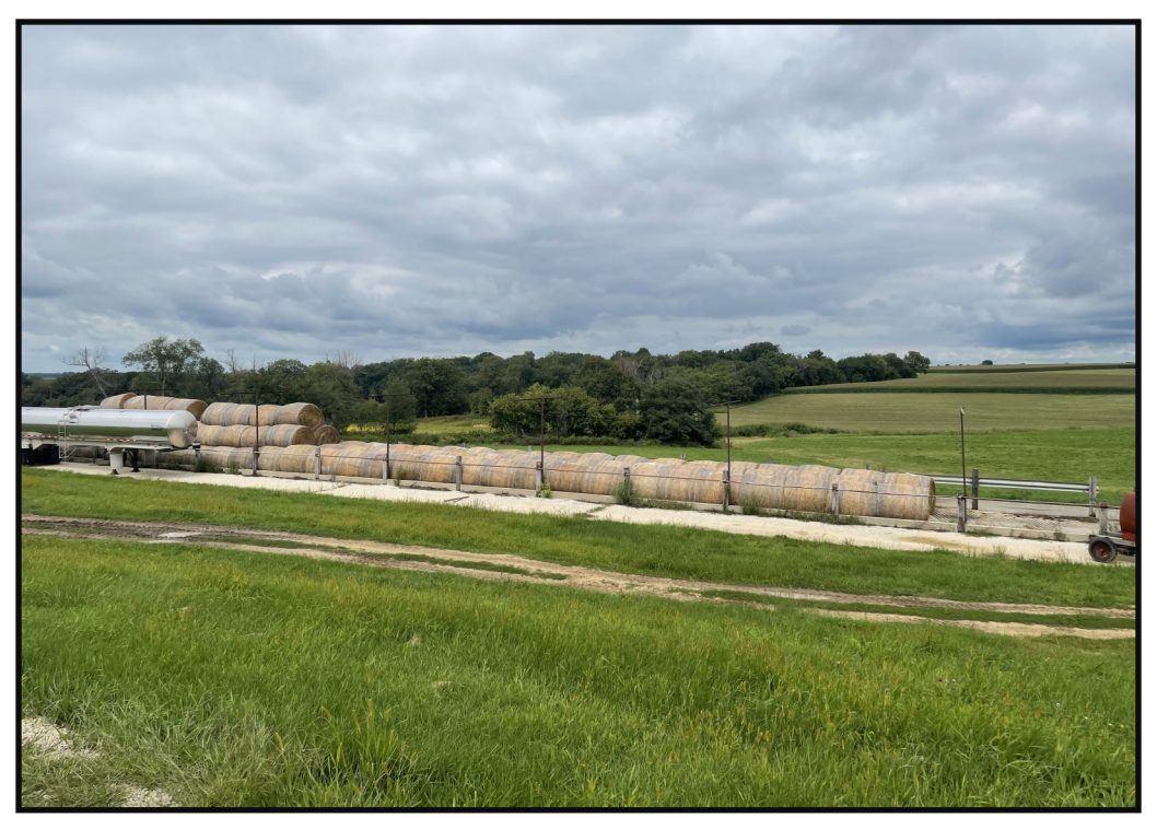
Photo 1 (Right): Looking north west at the former outdoor concrete feedlot. The outdoor lot has been completely abandoned and is now being used for storage.

The operation once utilized an outdoor concrete feedlot located near the north east end of the site. Plans to abandon the outdoor lot were approved by the Department on August 29, 2017 and the lot has since been abandoned.