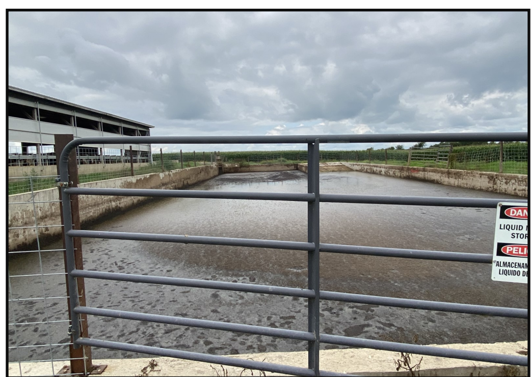
Photo 10 (Left): Looking west across WSF 4. A safety fence was observed around the entire perimeter of the of the waste storage facility and a permanent maximum operating level marker can be seen on the northern wall. A layer of dried manure extending above the maximum operating level can also be seen along the walls of WSF 4.

The operation also utilizes a concrete lined liquid waste storage facility located adjacent to the dry cow barn (WSF 4). WSF 4 was constructed in 2014 and has an approximate maximum operating level capacity of 361,735 gallons. WSF 4 was evaluated in 2018 and the Department determined no further action was required. Liquid manure and contaminated sand bedding generated within the dry cow barn are manually transferred to WSF 4.