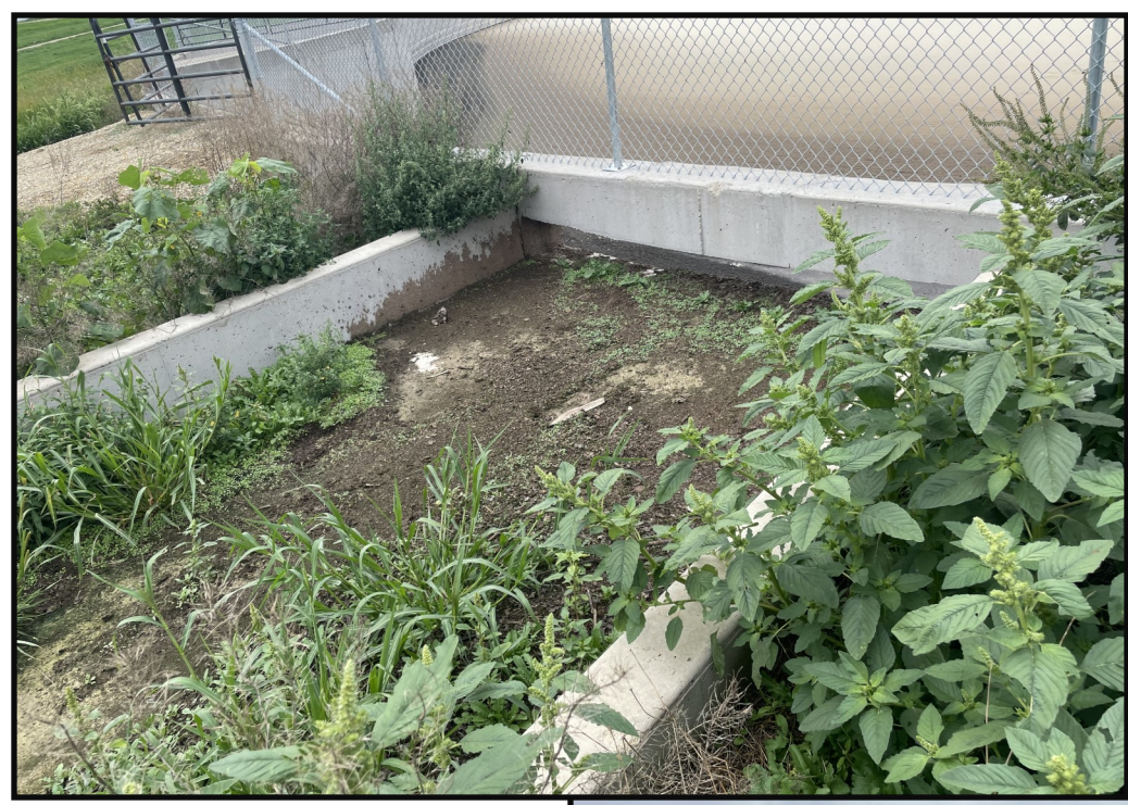
Photo 7 (Top Left): Looking at the overflow channel where manure from WSF 2 flows into WSF 3. Manure solids and vegetation growth can been seen accumulating within the overflow channel.