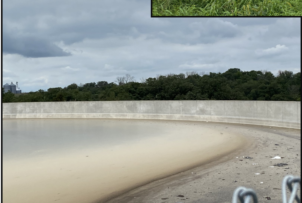
Photo 9 (Bottom Left): Looking north across WSF 3 toward the permanent maximum operating level marker. A permanent margin of safety marker was not present in WSF 3.