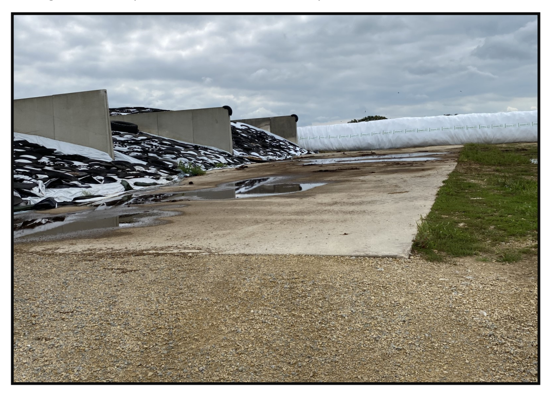
Photo 12 (Left): Looking south along the west end of the feed storage area. The western portion of the feed storage slopes east toward the center of the feed storage area where leachate and feed storage runoff is directed to the runoff collection basin (pictured in photo 16).

initially constructed sometime in the early 2000s without a runoff control system in place. Plans and specifications for a feed storage runoff control system were approved by the Department on August 29, 2017 and the feed storage area itself was evaluated in 2018. Based on the evaluation of the feed storage area, the Department determined no further action would be required provided the proposed feed storage runoff control system was constructed as approved by the Department. A schedule to complete construction of the approved feed storage runoff control system was also included under permit section 2.5 of the current permit. Construction of the approved runoff control system was completed in 2019 and post construction documentation was submitted on December 10, 2019. The feed storage runoff control system consists of a concrete runoff collection basin located on the south end of the feed storage area and a gravity transfer system where leachate and feed storage runoff is captured and transferred directly to WSF 3.