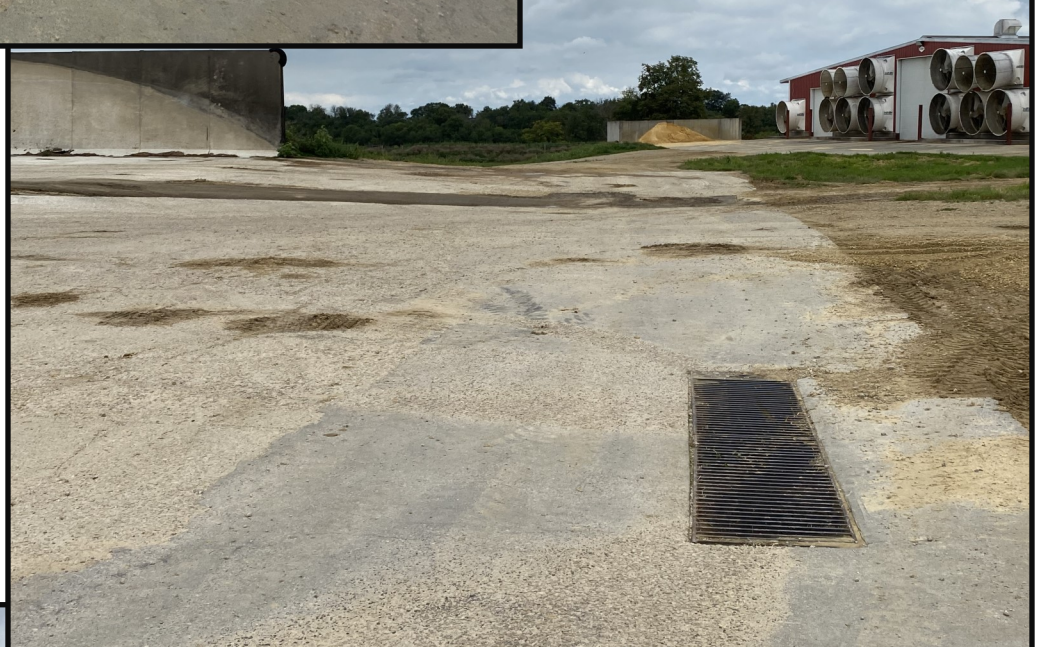
Photo 15 (Right): Looking north along the east end of the feed storage area where inlets to the runoff transfer system are located. Leachate and feed storage runoff that enters the runoff collection basin or directly enters through the inlets to the runoff transfer system are transferred to WSF 3.

Photo 14 (Top Left): Looking west toward the east end of the feed storage area. Portions of the east end of the feed storage slope east away from the center of the feed storage area where leachate and feed storage runoff is directed to the runoff collection basin. Leachate and feed storage runoff that does not flow west toward the runoff collection basin flows east where it directly enters inlets to the runoff transfer system (pictured in photo 15).