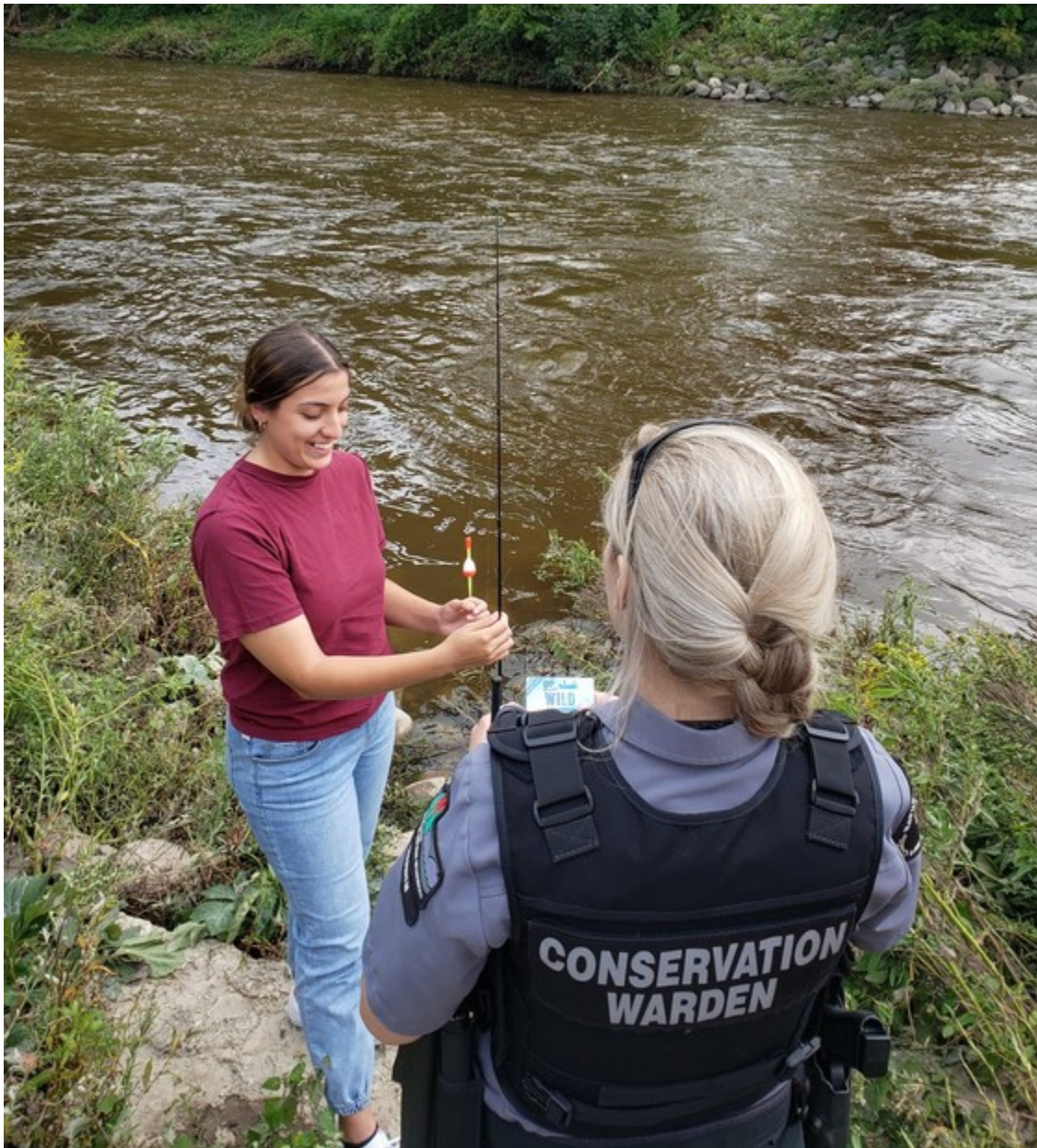
DNR Conservation Warden speaks with an angler in Milwaukee County.