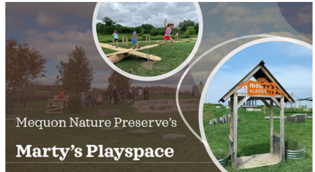
Mequon Nature Preserve's Marty's Playspace

Recognized with the Lifetime Achievement award for assisting dozens of communities and entities in enhancing their urban forestry programs, especially the Village of Fox Point