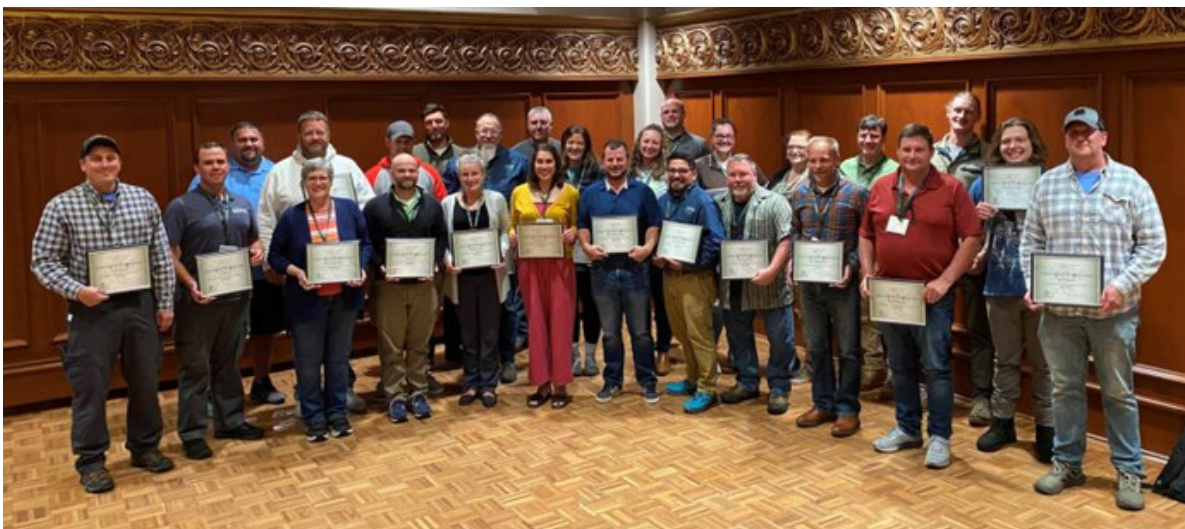
2023 CTMI Graduating Class, Stevens Point