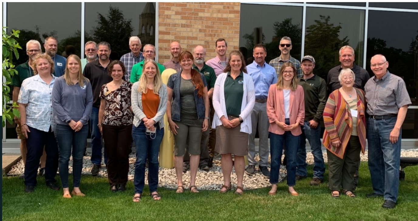
Stevens Point, June 2023