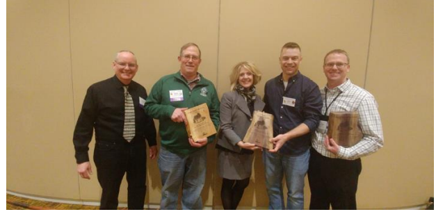
2018: The Green Bay Area Arbor Day Seedling Distribution Project receives the award for Project Partnership.