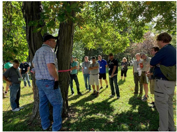
CTMI graduate workshop, 9-2019; Green Lake Conference Center.

First Down for Trees: This program has been proven to be a great success with the Green Bay Packers. Thousands of trees have been planted since 2011, providing millions of dollars of total lifetime benefits through storm water runoff reduction, CO 2 reduction, energy saving, air quality improvement and property value increase. Promotion of this program increases public awareness of the importance of trees. In recent years the Milwaukee Brewers have discontinued their tree planting programs ( Root Root Root for the Brewers ). Using the Green Bay Packer model, the Council hopes that the WDNR can work with the Brewers to reactivate their tree planting programs with strong and robust partnerships.