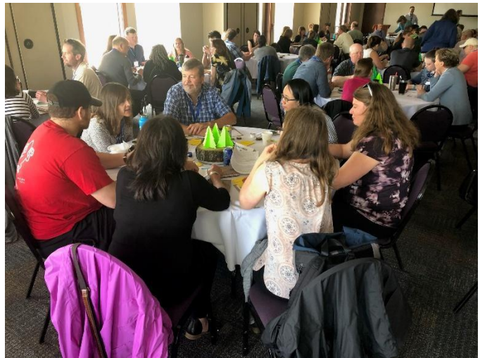
Conference attendees connect during the interactive session.