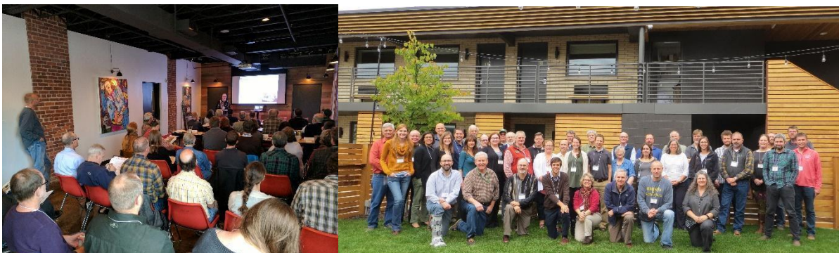
Joint Council meeting with groups from IA, IL, IN, MI, MN, and WI, 10-2017; Eau Claire, WI.