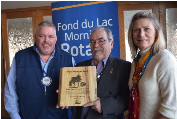
2019: Rotary District 6270 receives Project Partnership Award.