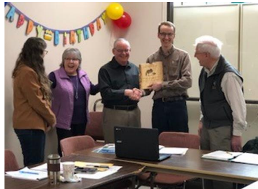
2019: Golden Sands RC&D receives Innovations in Urban Forestry. Award