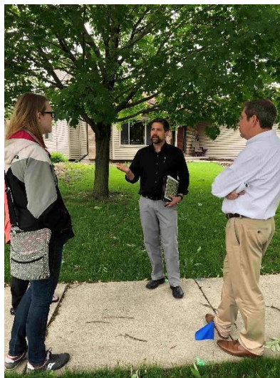
Council tour of Fond du Lac, WI stormwater management project, 6-2019.

Once the USGS has analyzed the results of the studies, we hope that cities that retain or plant more trees to increase urban tree canopy—and those that use a leaf management program like Fond du Lac’s—can both use these BMP’s (best management practices) in meeting permit requirements, and as a result will be motivated to promote the urban forest.