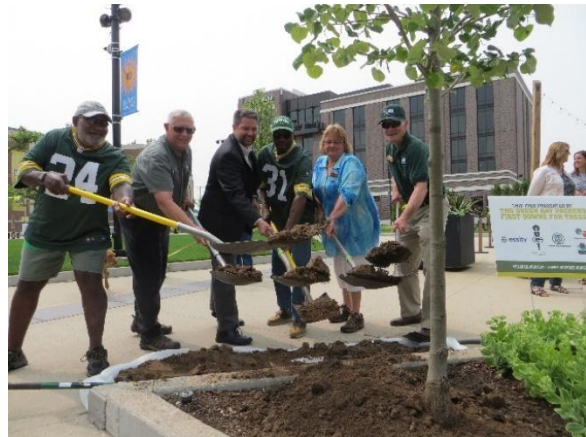
First Downs for Trees media celebration, 7-2019; Titledown Green Bay, WI.

Urban Forestry Grant Program: Over the years this program has been hugely successful in supporting cities, villages, towns, counties, tribes and 501(c)3 nonprofit organizations in the development of new and innovative projects that develop sustainable urban and community forestry programs. A list of the past two years of grant recipients is provided in Appendix C. In 2019 $500,000 were allocated to the grant program. This program is instrumental in advancing improvements of urban forestry programs and is a catalyst for economic development. There is high demand for the program and numerous applicants are denied each year due to lack of funding availability. Twenty percent of the grant money is withheld for possible storm grants, and then released for regular matching grants if not used. In 2019, all the storm grant money was allocated, creating a situation where numerous high-quality grant applicants for matching grants had to be rejected. With the ongoing emerald ash borer crisis, and more frequent