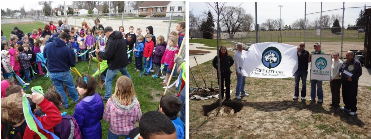
Many communities celebrate Arbor Day and their Tree City USA awards with tree plantings.

Tree City USA: This long running WDNR Urban Forest program sponsored by the Arbor Day Foundation in cooperation with the USDA Forest Service has been a great success in Wisconsin. According to 2018 data, 58.75% of WI residents live in a Tree City USA community and 195 WI communities qualified in the Tree City USA program. This program provides valuable direction, technical assistance, and public recognition to municipal forestry programs in WI. Wisconsin has been a national leader in the Tree City USA program. Overall growth in the program has slowed down as the Tree City USA program has saturated most communities. 20 Wisconsin communities have received the Growth Award, which is a higher level of tree care that highlights innovative programs and projects as well as increased commitment of resources to urban forestry programs. The Council sees great value in this program providing guidance to municipalities and raising awareness to the public. We wish to see the WDNR Urban Forestry team continue to strategically work with non-Tree City USA communities to increase participation in this valuable, highly visible program. The Council also requests that the WI Urban Forestry Team work with the USDA Forest Service and Arbor Day Foundation to review the higher-level Growth Award Program to increase community participation.