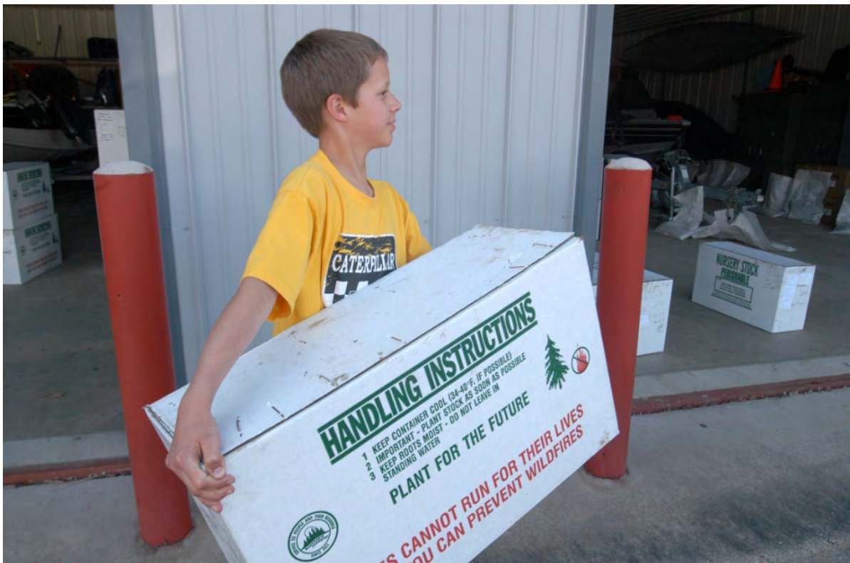
Sample of shipping boxes (storage requirements)