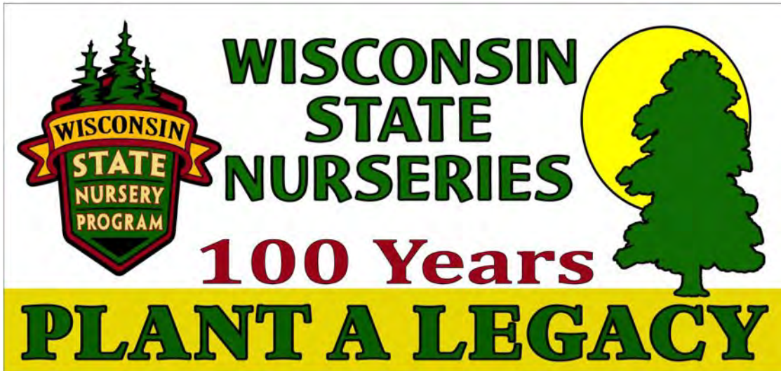
Nursery Centennial Banner