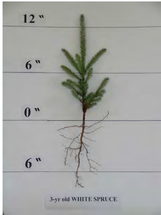
White spruce seedling for distribution