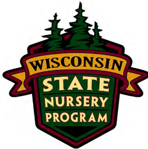
WDNR Nursery Logo