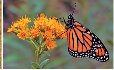
Monarch on goldenrod