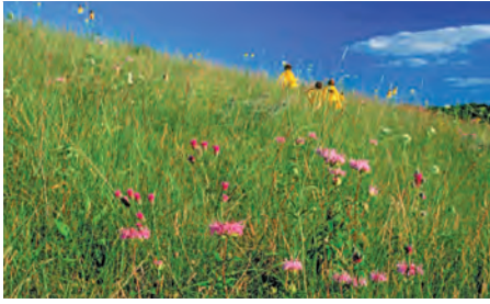
Barneveld Prairie flowers