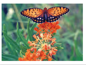
Regal fritilla butterfly

From the South: US Highway 39, turn north on Highways J & JG. Take Highways A and G north and look for the parking lot to the west.