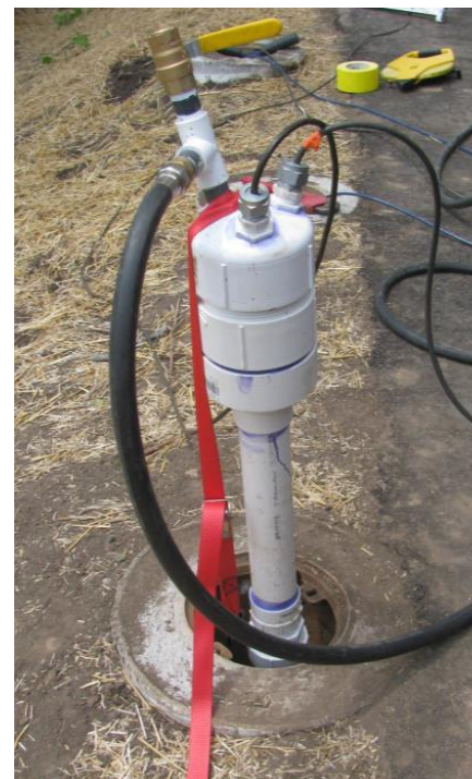
Pumping test at one of Madison's municipal wells, part of a WGRMP-funded study to enhance understanding of fractures and virus transport.

There are unanswered questions about viruses in drinking water as well. While previous work has suggested that municipal sanitary sewers may be potential sources of viruses in groundwater, the exact mechanism of viral transport from a sewer system to a water supply well, in cities like Madison is, however, unknown and cannot be explained by normal assumptions about hydrogeology. More research is needed on the transport and survival times of various viruses in groundwater aquifers.