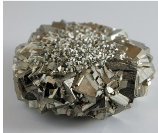
Arsenic-rich minerals, such as arsenic-rich pyrite (pictured), are natural sources of arsenic in groundwater in Wisconsin.

In southwestern Wisconsin sulfides associated with the lead-zinc district have contaminated a number of wells. Further north, sulfides in the Tunnel City formation have forced the replacement of at least a dozen wells from La Crosse to Barron counties. A report by Zambito et. al. 1 explains the occurrence of arsenic and metal bearing sulfides. Other metals commonly associated with arsenic are nickel, cobalt, copper, aluminum and vanadium.