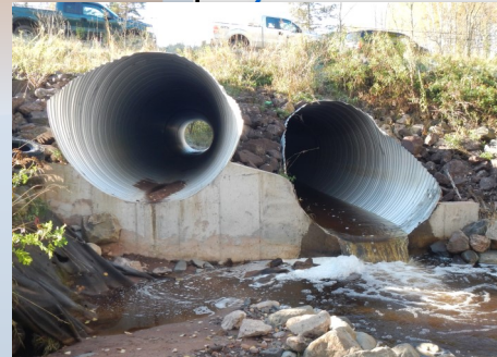
Site 1. Co. Hwy. B Passability Score = 0