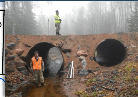
Site 2. Severson Rd. Passability Score = 0.5