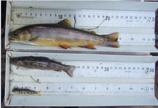
Left: Multiple year classes of brook trout were observed after the June 2018 flood event.

Phase two was replacement of the Gandy Dancer State Trail crossing. Construction was completed in October 2024.