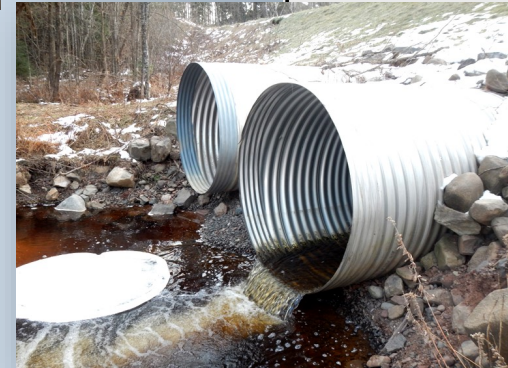
Site 3. E. Patzau Foxboro Rd. Passability Score = 0