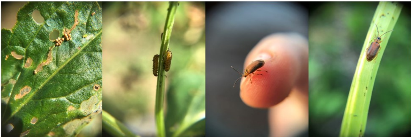
Life cycle and rearing of purple loosestrife beetles.

VISION: Lake Superior will be free from adverse impacts of aquatic and terrestrial invasive species (GLWQA, 2012; LAMP 2020).