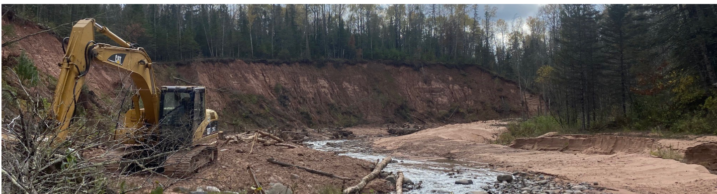
Northland College led effort to stabilize bluff locations along WDNR property on Fish Creek in Bayfield County.

VISION: Lake Superior will allow swimming and other recreational use, unrestricted by environmental quality concerns. Lake Superior will also support healthy and productive habitats to sustain native species (GLWQA, 2012; LS LAMP, 2020). Drinking waters should not be impaired from increased sedimentation.