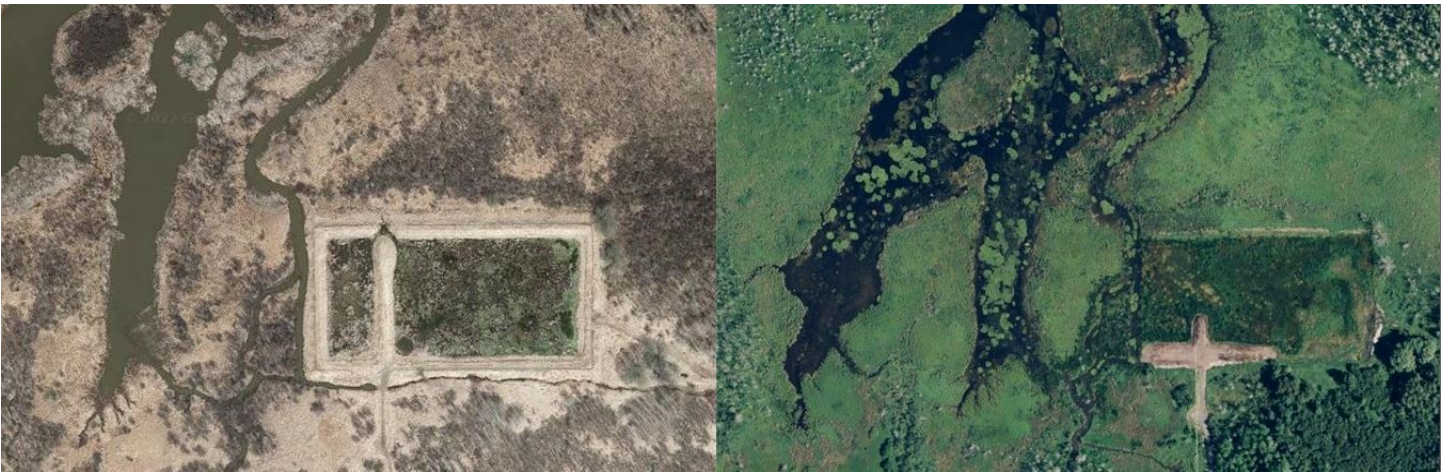
The Michelle Wheeler Wetland Restoration Site started as Port Wing wastewater pond seen on the left. The photo on the right was taken in 2021 after the site saw a couple seasons of growth. Map Aerials

VISION: Lake Superior will support healthy and productive wetlands and other habitats to sustain resilient populations of native species (GLWQA, 2012; LAMP, 2020).