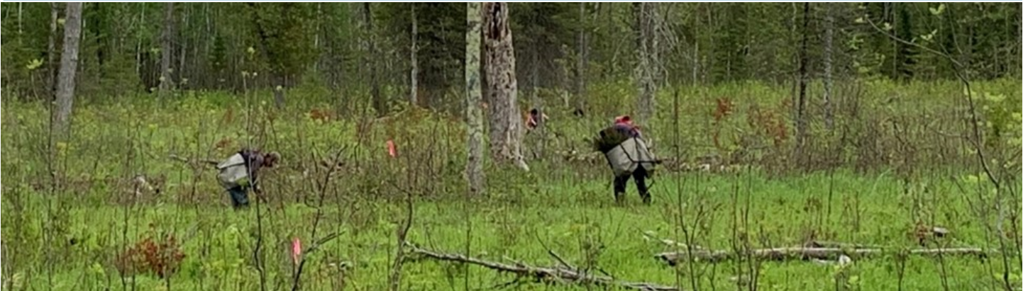
Building climate resiliency through underplanting efforts in black ash dominated wetlands impacted by EAB.

VISION: Lake Superior will allow for swimming and other recreational use, unrestricted by environmental quality concerns, allow for human consumption of fish & wildlife, be free of pollutants that could be harmful, and be able to sustain resilient populations of native species (GLWQA General Objectives, 2012).