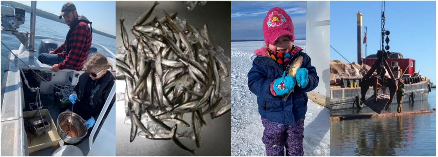
Photos from left to right: 1) Lake Superior Team sampling contaminants in sediment in the St. Louis Estuary. 2) Rainbow Smelt PFAS Sampling. 3) Little girl holding her catch on Lake Superior. 4) Dredging at Ashland superfund site.

VISION: Lake Superior is a source of safe, high-quality drinking water. Levels of toxic pollutants will not contribute to restrictions on fish and wildlife consumption by humans. The waters will be free from contaminants and groundwater impairments that could harm people, wildlife, or ecosystems (GLWQA 2012; LAMP 2020).