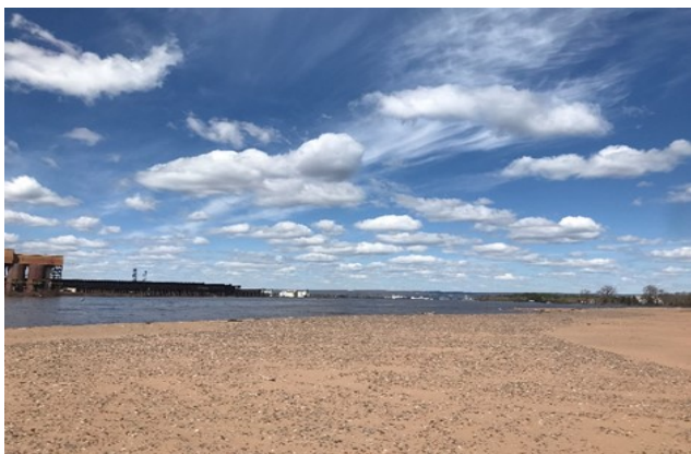
Above: 15 acres of beach habitat restored for the endangered Piping Plover bird at WDNR's Bird Sanctuary along WI Point.