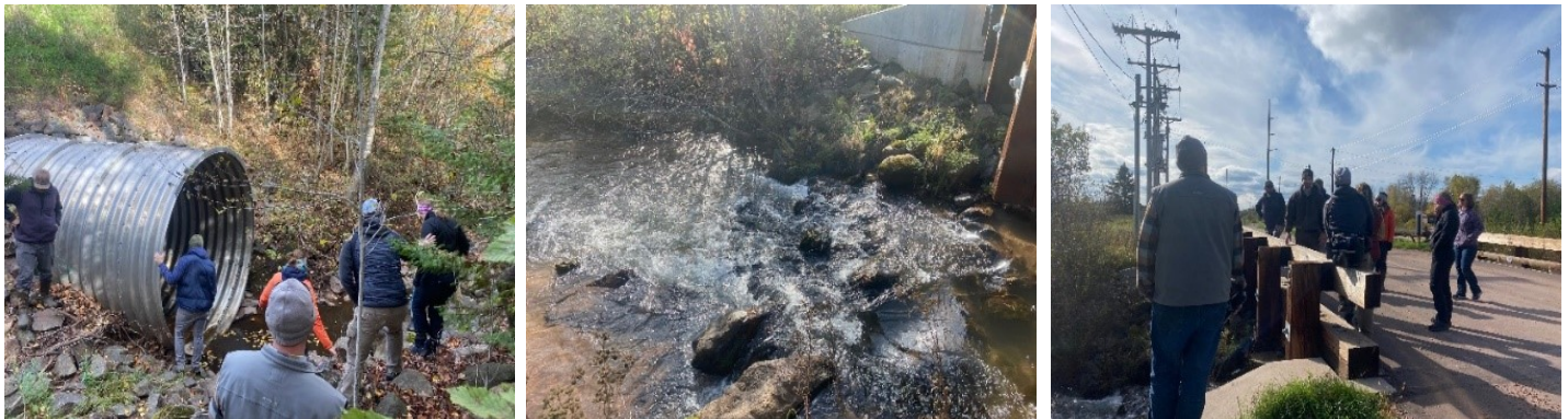
Learning about in-stream restoration projects in Lake Superior tributaries from Lake Superior Partners.