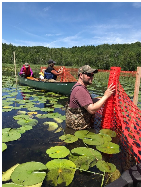
WDNR Lake Superior Team installing fencing to exclude geese from wild rice restoration sites in the Saint Louis Estuary.

Wildlife Action Plan (WDNR, 2016), Lake Superior Fisheries Management Plan (WDNR, 2020), Wisconsin Forest Action Plan (WDNR, 2020), the Lake Superior Biodiversity Conservation Strategy (Lake Superior Binational Program, 2015), the St. Louis River AOC Remedial Action Plan , the WDNR Office of Great Waters Strategic Plan, and others referenced in Appendix A .