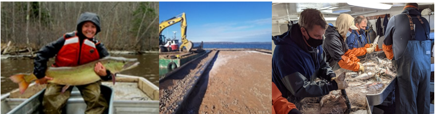
Photos from left to right: 1) St. Louis River muskellunge survey 2) Tern Island Restoration in Ashland. 3) Lake Superior Cisco Survey. Below: Cattail control efforts in Michelle Wheeler Wetland Restoration site.