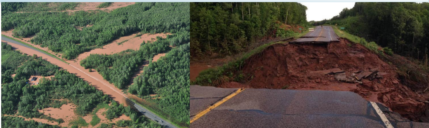
The Wisconsin portion of the Lake Superior Basin was impacted by historic flood events in 2012, 2016, & 2018. We learned many lessons from those events and are working towards building more resiliency in the Basin. From left: 1) Highway 2 after 2016 flood. Ashland County Hwy Dept 2) Highway 13 after 2016 flood, near Highbridge. Ashland County Hwy Dept