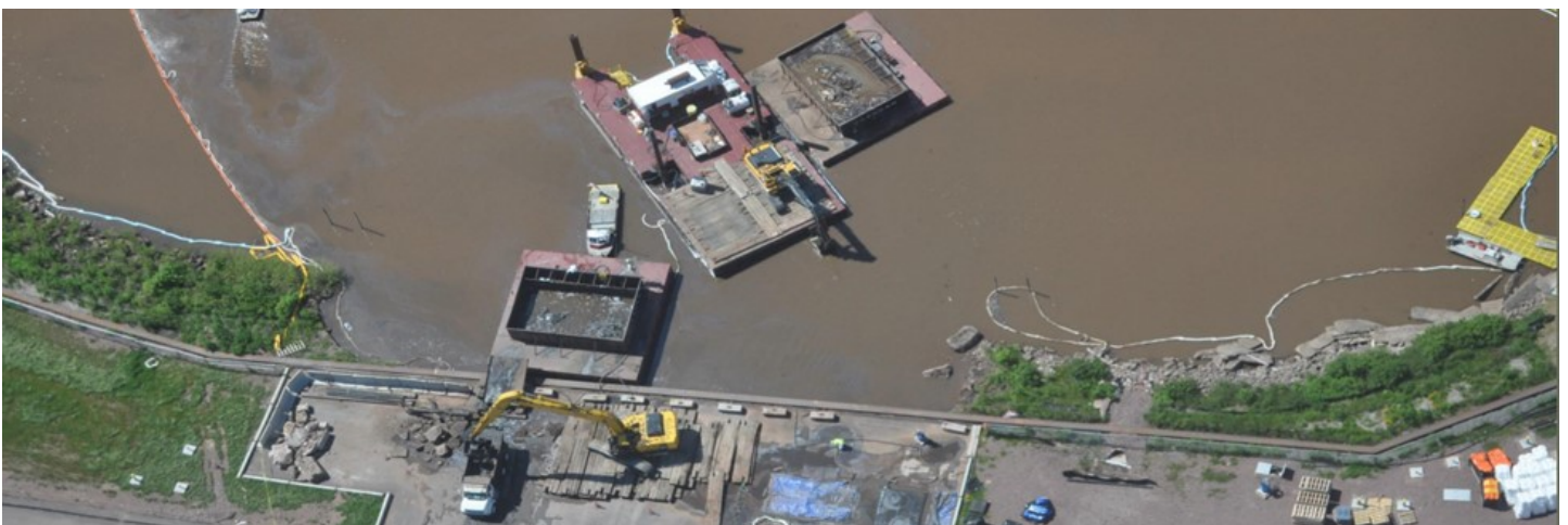
Ashland Superfund site cleanup.