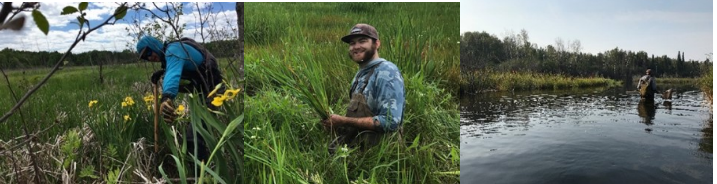
Pictures from left to right: 1) Douglas County Partner assisting with Yellow Iris Control on Brule River. 2) Controlling cattails in a wetland restoration site. 3) Early detection monitoring in coastal area White River Fisheries Area.

Bottom of Pg. 16. captions left to right: Pulling of yellow iris from Loon Lake, Brule River Yellow Iris. Curly Leaf Pondweed Removal in Lake Superior.