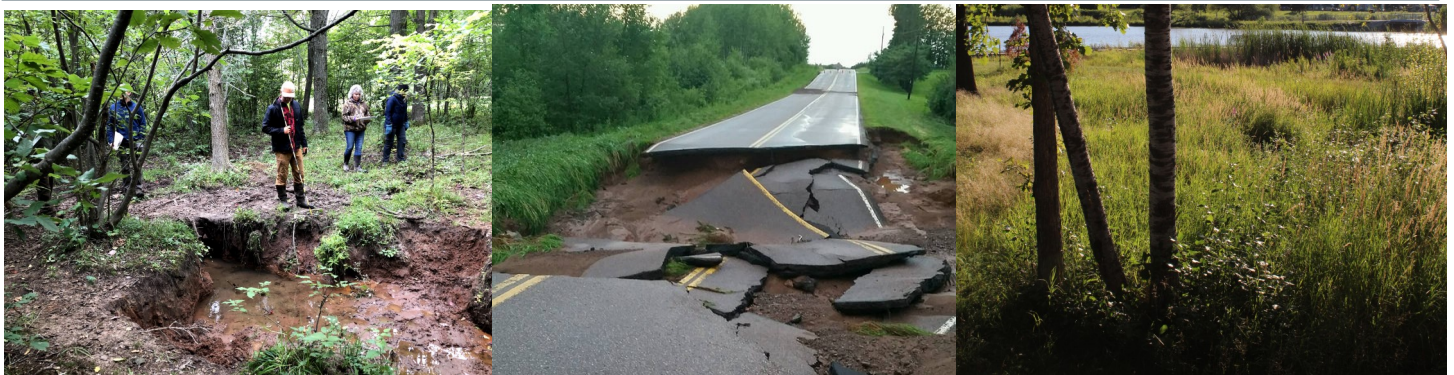
Photos from left to right: 1) Exploring headcutting after 2016 flood event. Wisconsin Wetlands Association. 2) Road damage Ashland County Highway C after the 2016 flood. Wisconsin Emergency Management (WEM) 3) Native plantings that occurred along the shoreline of Barker's Island.