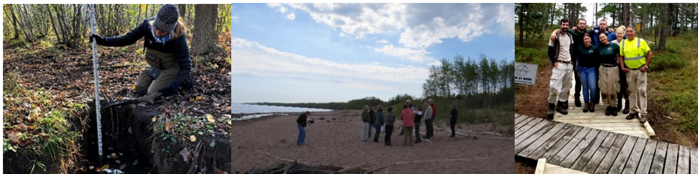
Photos from left to right: 1) Building an understanding of head cutting in Marengo River Watershed. Wisconsin Wetlands Association 2) Discussion of shoreline restoration options with partners. 3) Boardwalk completed from Lake Superior to Big Bay State Park lagoon.