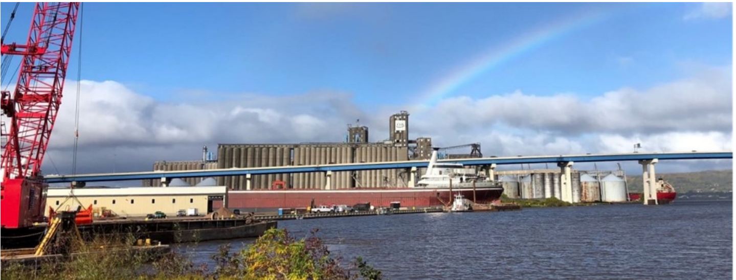
A rainbow over the Howard's Bay contaminated sediment clean-up.

VISION: Remove all beneficial use impairments and delist the St. Louis Estuary as a Great Lakes Area of Concern by 2030. with completion of all construction projects by 2024.