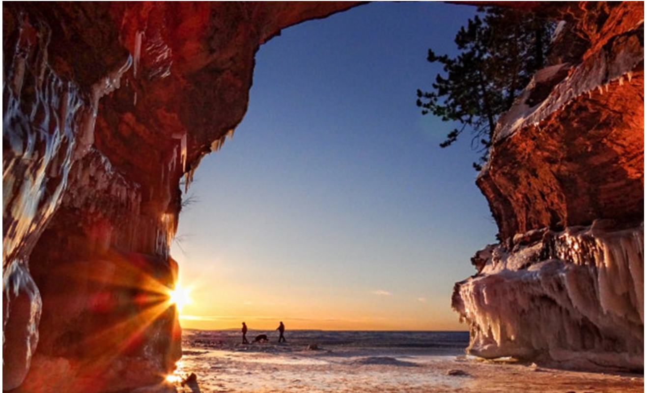
Cave Walk. 2018 Great Waters Photo Contest. Sheri Erickson