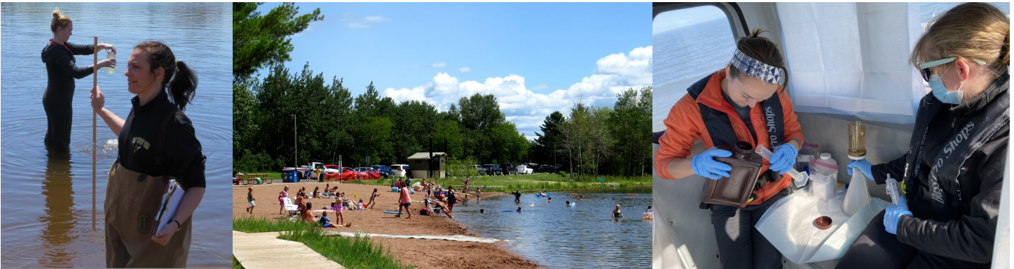
Top photos from left to right: 1) Partners beach monitoring near Barkers Island. 2) Community members enjoying a day at the beach on Barker's Island. 3) Nearshore monitoring efforts. Bottom photos from left to right: 1) Elevated boardwalk on Barker's Island so area can still be used during highwater and foot traffic disturbances are kept to a minimum. 2) Nearshore monitoring efforts 3) Healthy Lake Superior beach.