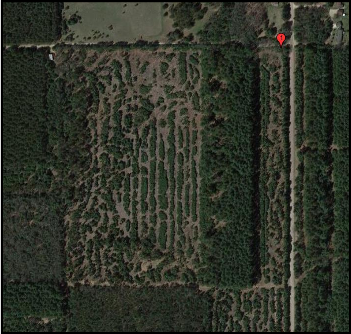
Figure 5: Current aerial imagery of the stands showing damage to regeneration caused by harvesting and skidding operations. Photo courtesy of Google Maps and obtained in December 2017.