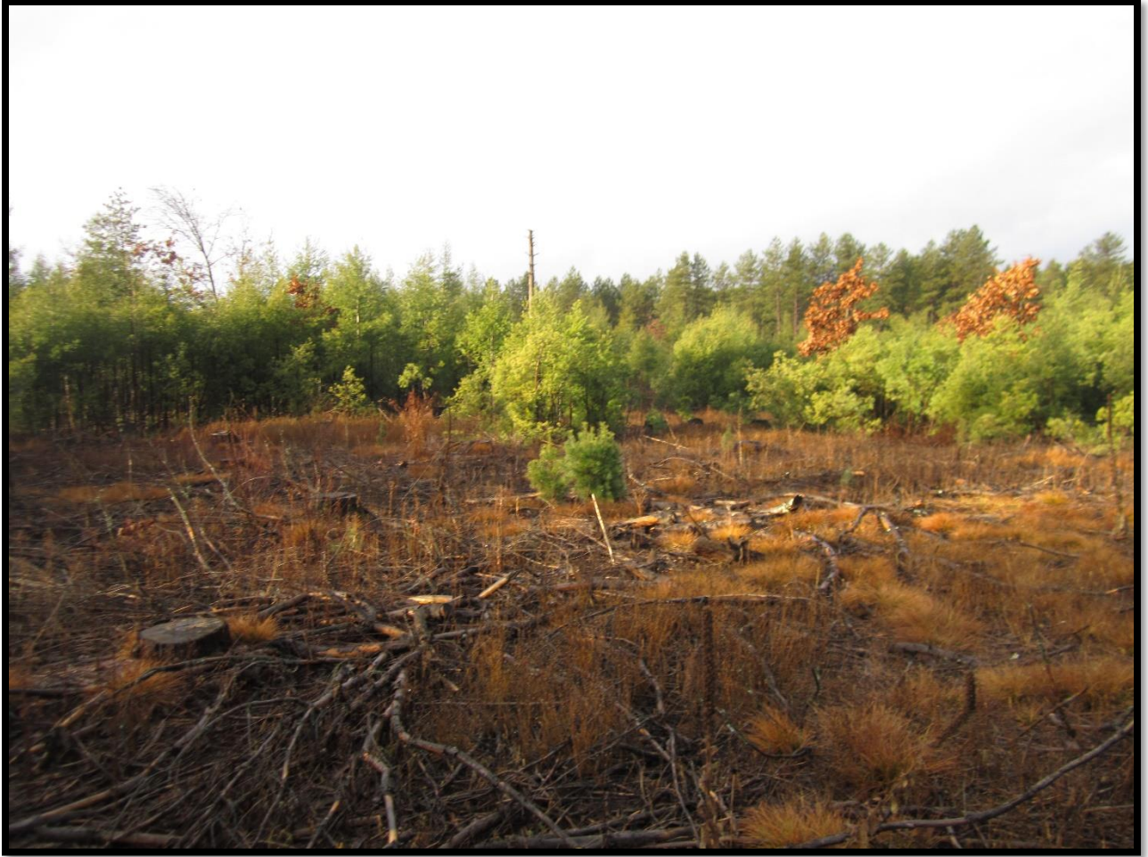
Figure 4: A picture of the property post-treatment in December 2015.