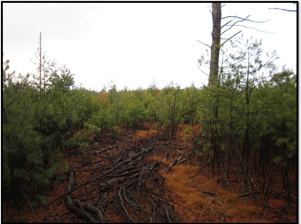
Figure 3. Slash trail on the property post-treatment in December 2015.