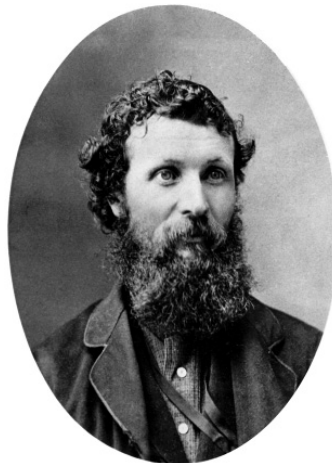
John Muir

"But how can that be," I objected, "when the pea is a weak, clinging, straggling herb, and the locust is a big, thorny hardwood tree?"