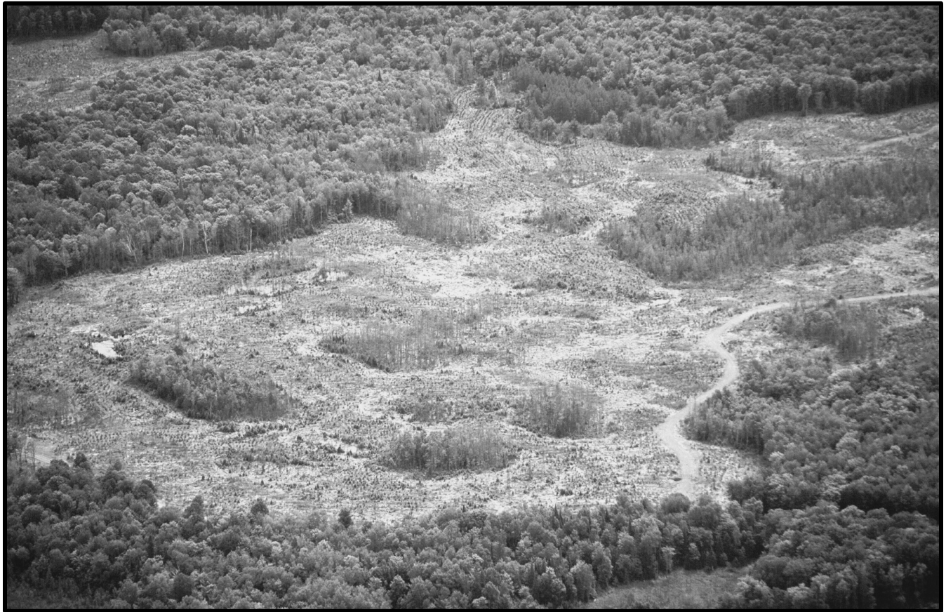
Figure 24.7. Reserve trees retained in patches.

Retention of evenly dispersed individual trees also provides unique benefits, including: