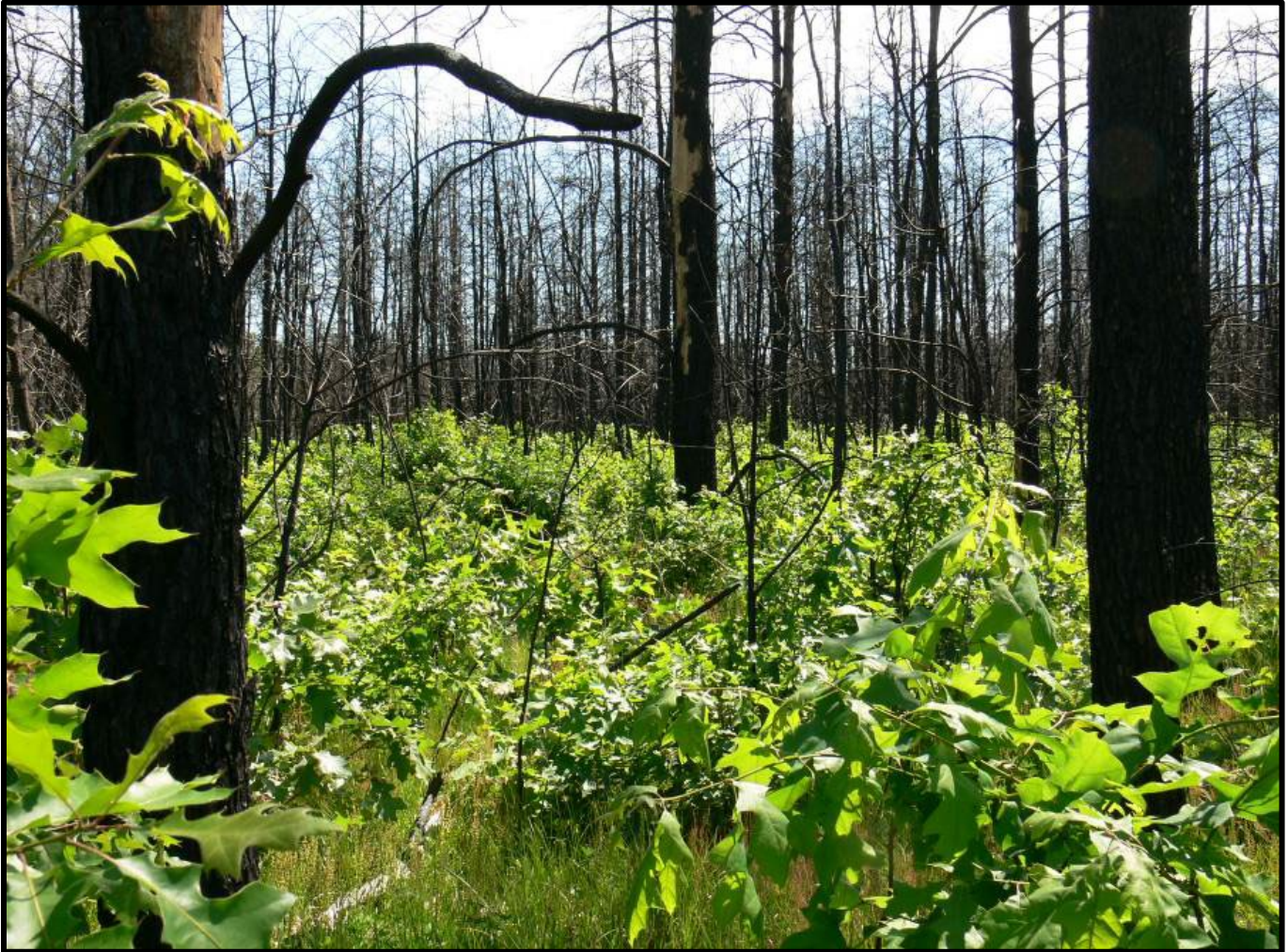
Figure 24.6. Biological legacies following fire.

species, vernal pools, seeps, wet depressions, cliffs, rock outcrops, ravines, and caves. Some of the forest cover type chapters in this guide provide biodiversity management considerations, and specific species are sometimes addressed.