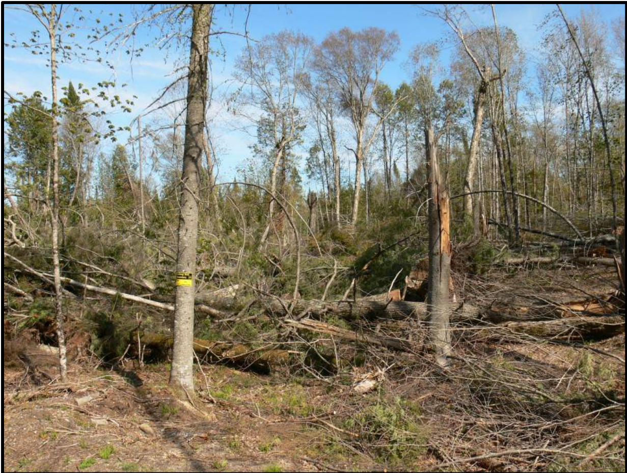
Figure 24.5. Biological legacies following windstorm.

Many biodiversity and endangered resources issues are addressed at the landscape level, and then through the protection of special habitats. Within managed stands, identify and protect element occurrences and special habitats. Follow general wildlife management guidelines; select and retain wildlife trees, including reserve trees as dispersed and aggregated individuals, groups, and patches. By integrating the identification of special habitats and microsites with the retention of reserve tree patches, multiple benefits can be achieved. Areas to consider when selecting patches for retention include groups of trees that are older or have high species diversity, sites where understory composition exhibits high diversity or uncommon