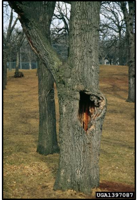
Figure 24.2. Cavity tree (photo by Joseph O'Brien, USDA Forest Service, Bugwood.org).