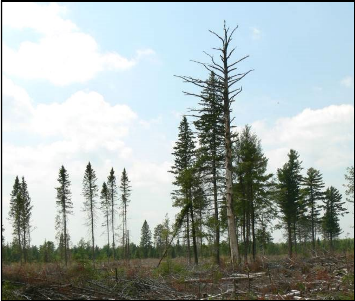
Figure 24.9. Reserve trees retained irregularly as individuals.