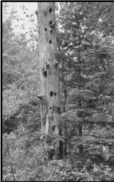
Figure 24.3. Snag.