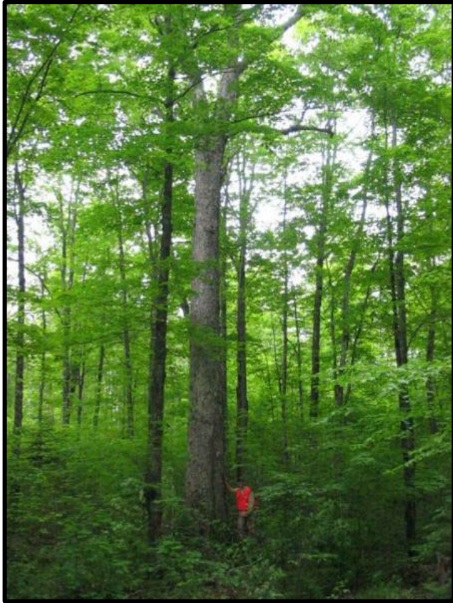
Figure 24.1. Large yellow birch tree.