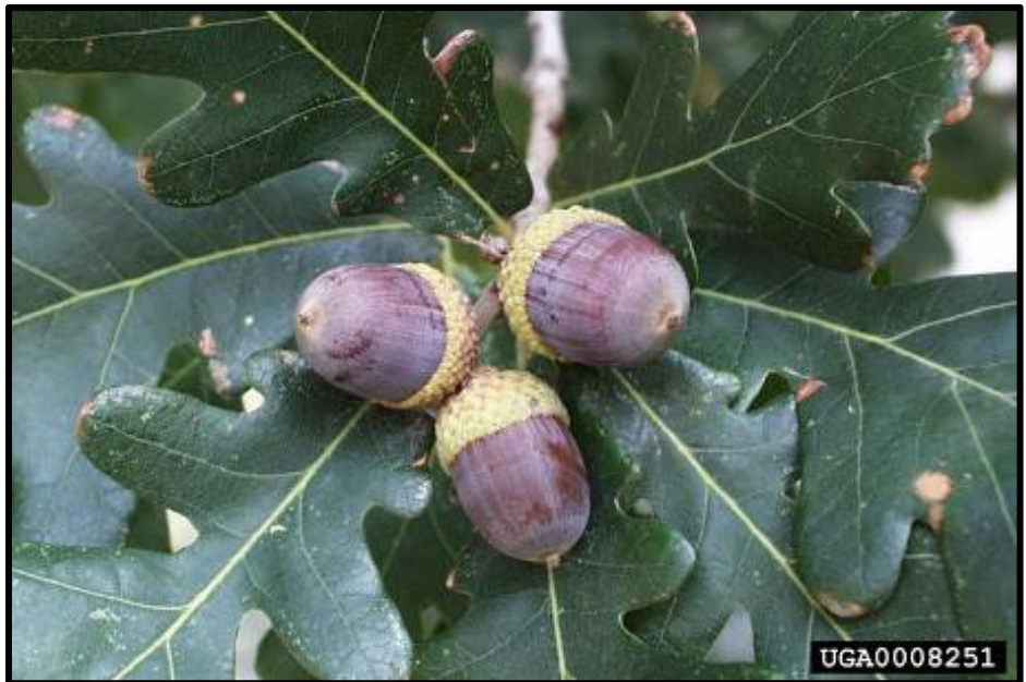
Figure 24.4. Mast.