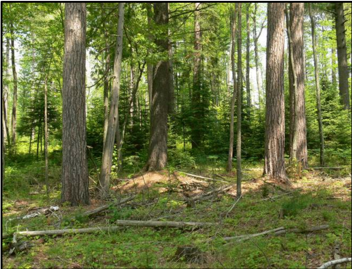
Figure 24.8. Reserve trees retained as a group.

Stand representation and spatial distribution patterns of reserve trees can be highly variable. The goal of heterogeneity of conditions indicates a wide array of retention strategies. Retention design, including amount to retain, species, and distribution, can enable the production of increased benefits and minimize potential costs. Criteria to consider when determining desired representation and distribution include landowner goals and stand management objectives, current and desired stand and community condition, characteristics of current and desired plant and animal species, potential damaging agents, site, and landscape characteristics. Detailed landscape analysis and planning that clearly addresses the sustainable allocation of resources, including the production of timber and the conservation of biodiversity, can improve upon stand-based management guidelines (such as those offered herein).