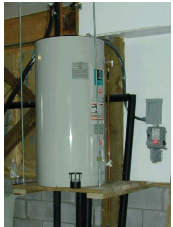
- Elevated water heater

DNR has produced a brochure entitled Living in the Floodplain: What You Need to Know – Who You Need to Know . If you would like a free copy of this brochure, please call (608) 267-7694 and ask for publication DNR Pub-WT-851-2006.