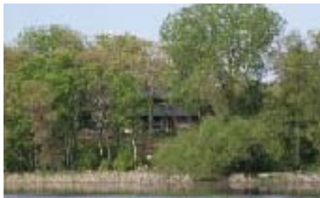
- Shoreland development on Lime Lake