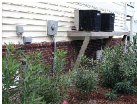
- Mitigation options