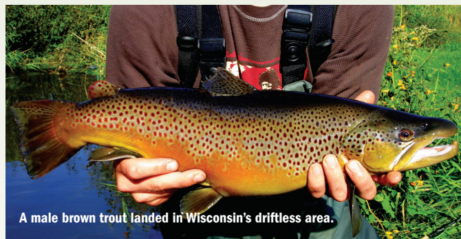
A male brown trout landed in Wisconsin's driftless area.

heart yearns to brave the crisp cold days of Wisconsin's early season. I like to be the first one to place a footstep in fresh snow on opening morning. It makes me feel like I am the first angler to ever set foot on that stream.