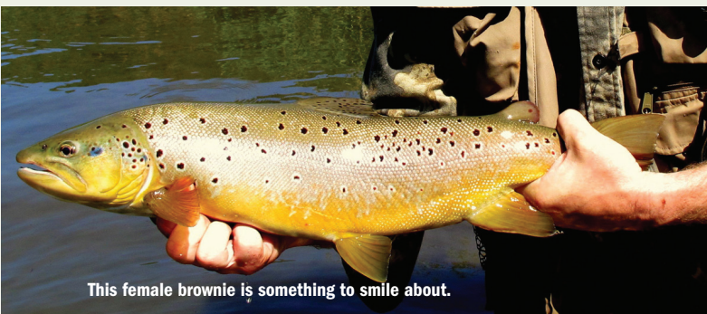
This female brownie is something to smile about.

Rain doesn't dampen the spirit of a diehard trout angler. They are willing to get up to their waist in mud if the task at hand demands it.