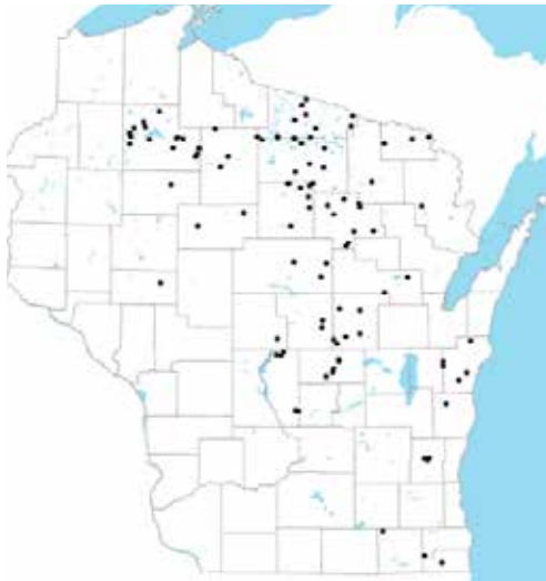
Figure 3. Distribution of 94 study lakes identified through fisheries biologists and angler surveys with populations of panfish that exhibited poor size and decent growth.