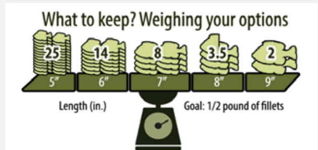
Figure 2. The number of bluegill by length that you would have to keep to equal 1/2 pound of fillets.

Even though anglers would take home fewer fish from some lakes, the expected increase in average size should result in the same amount of, or more, meat for the frying pan.