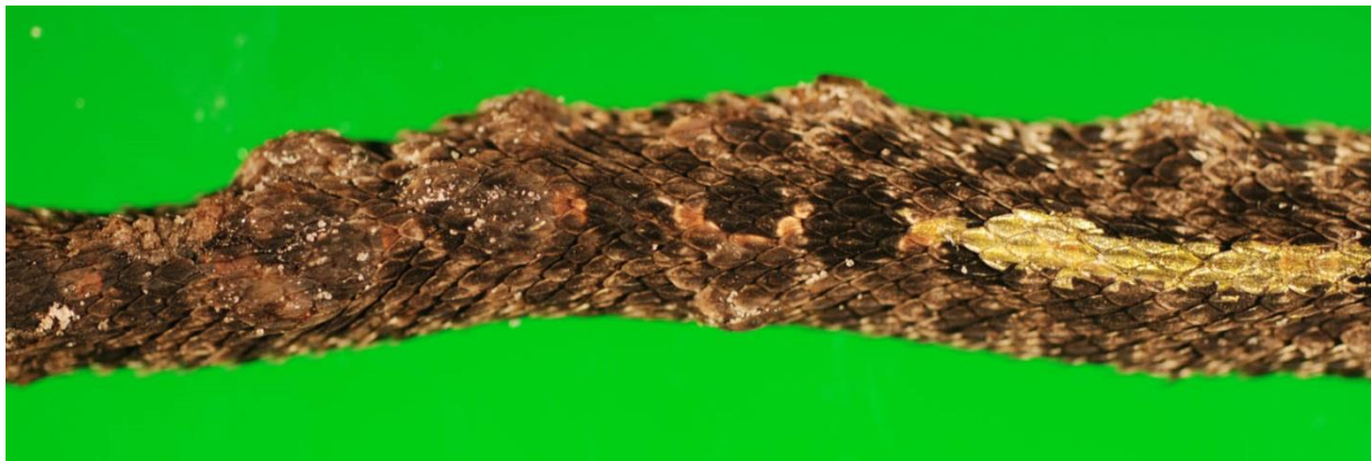
Tail of an infected pygmy rattlesnake. Note the numerous lumps (nodules) below the skin which are caused by the fungus.