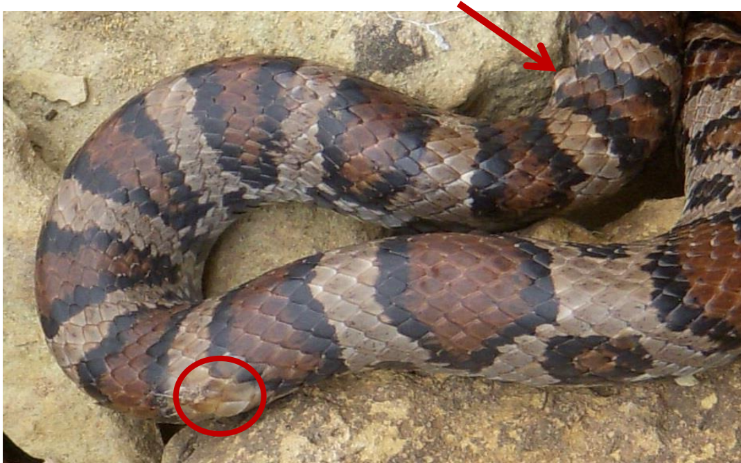
Milk snake with a nodule below the skin (arrow) and thickened/scabby scales (circled).