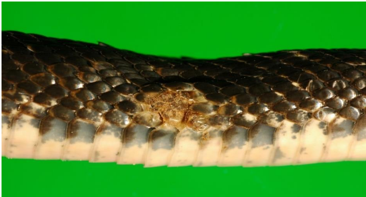
Patch of thickened, crusty scales on the side of the body of the same ratsnake.