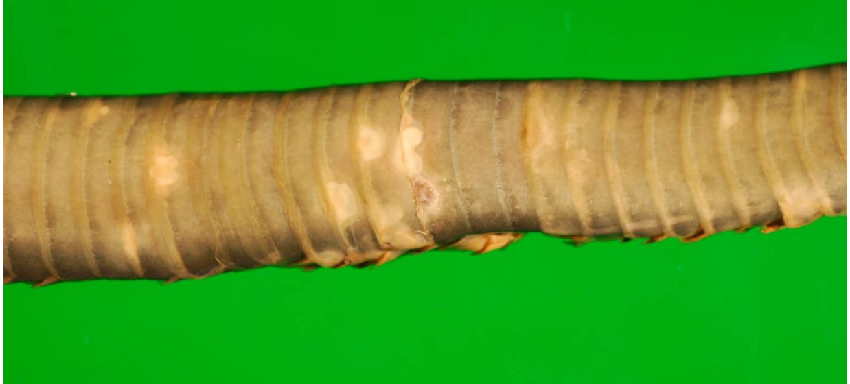
Belly scales of an infected racer. The white spots indicate thickening skin. A single brown spot (scab) is also visible.