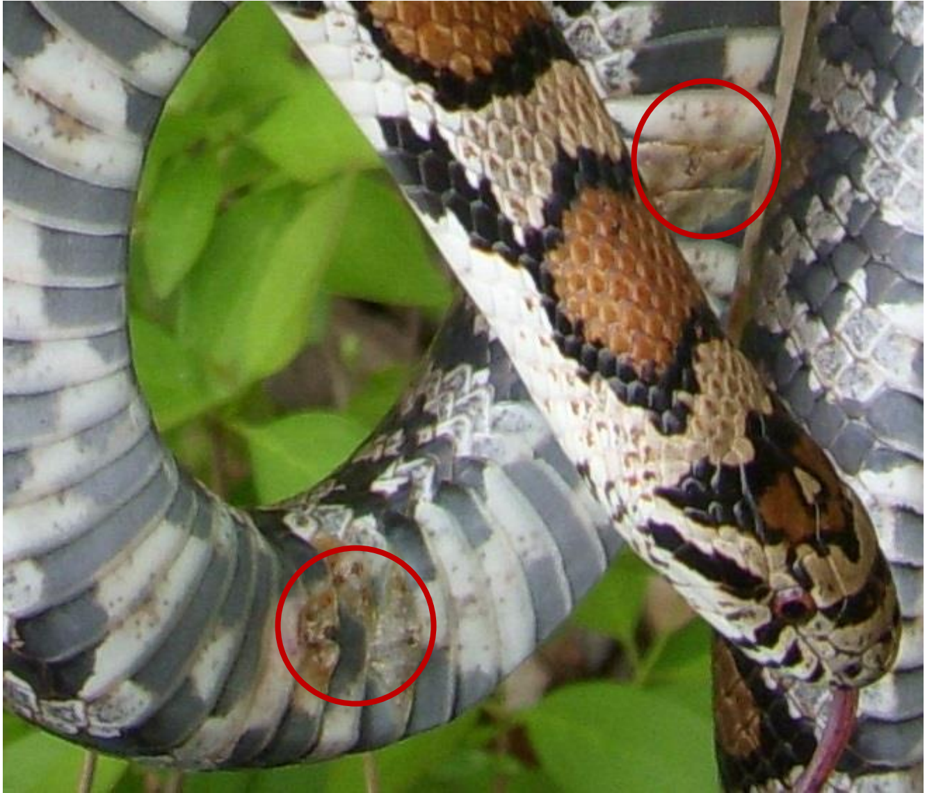
Milksnake with area of thickened, dead skin on the ventral scales.