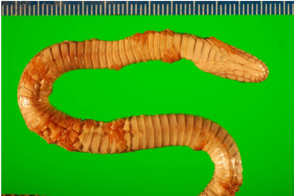
Water snake with numerous scabs, nodules, and blisters. This is a severe case and the animal died as a result of the infection.