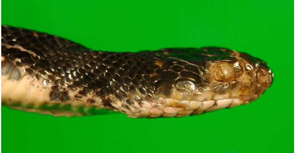
Ratsnake demonstrating scabbing and thickening of the skin on the snout, chin, jaw, and eye.