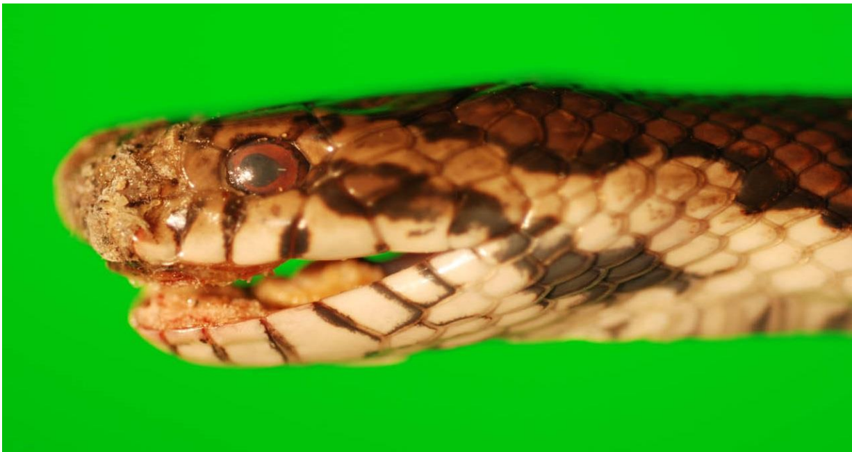
Milksnake with crusty skin on the snout and a severe mouth infection. The snout is a common site of infection in many snakes. This particular animal also had several nodules below the skin on the back half of the body (not shown).