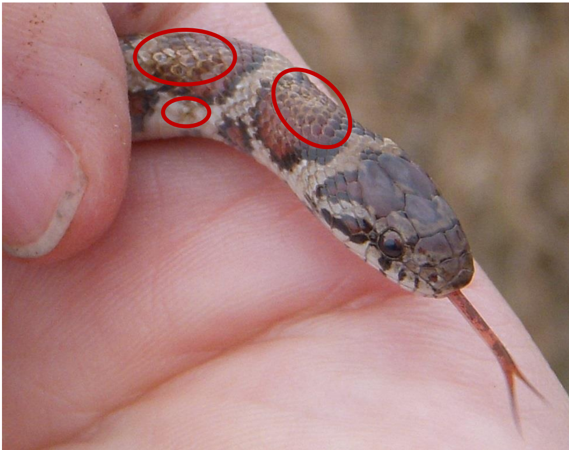
Milksnake with several areas of thickened skin.