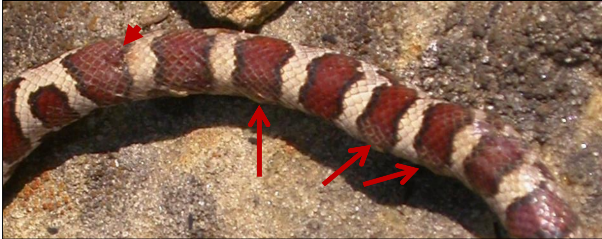
Milk snake found dead in the field with numerous nodules (arrows) and thickened scales (arrowhead) on the body. Also note the mixture of shiny and dull scales.