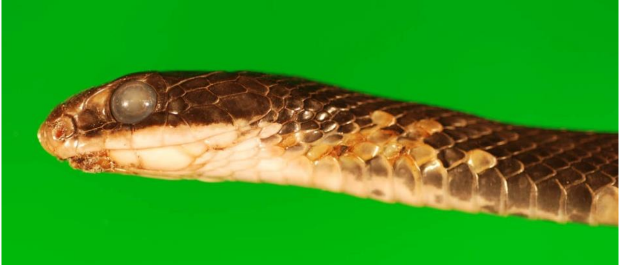
Racer with cloudy eyes, scabs on the chin and snout, and thickened scales on the neck.