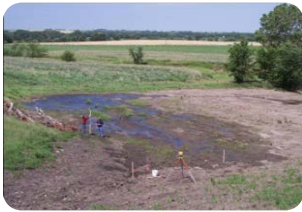
- Uncontrolled seepage