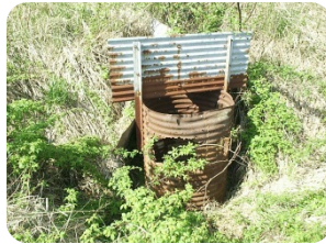
- Corroded outlet