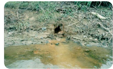
- Animal burrow

Internal erosion failures are often the result of physical structures which penetrate a dam such as outlet pipes buried in embankments or concrete spillways that cross the embankment. Other causes of internal erosion are tree roots and animal burrows. Decaying tree roots leave voids within the dam creating paths for water to enter and flow. Rodents such as beavers, groundhogs, and muskrats are naturally attracted to areas of ponded water such as dams and reservoirs. The tunnels these rodents construct can serve as pathways for seepage.