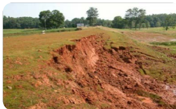
- Slope failure