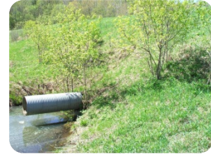
- Trees on embankment