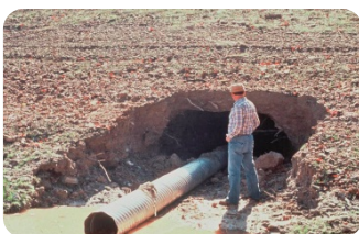
- Uncontrolled seepage/piping