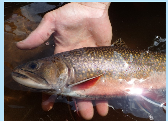
Figure 1. Brook trout captured in a DNR fisheries survey.