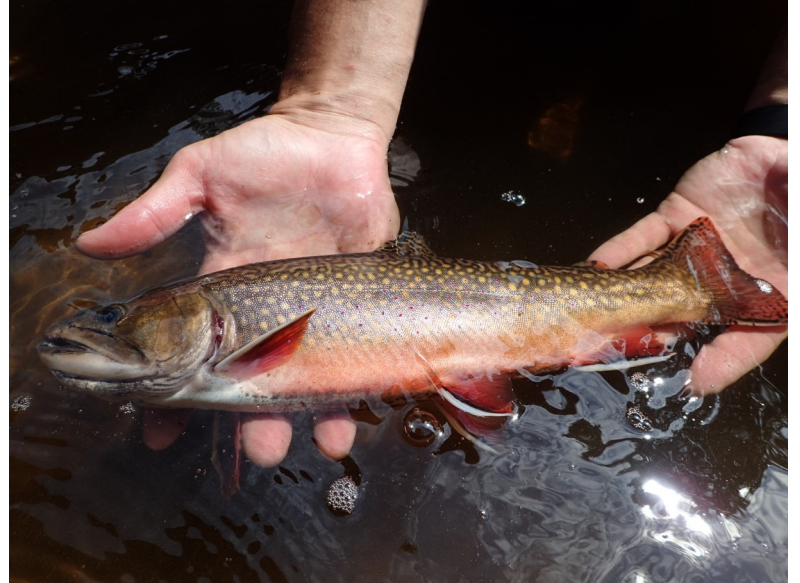
Figure 2. Brook Trout captured in a DNR fisheries survey.