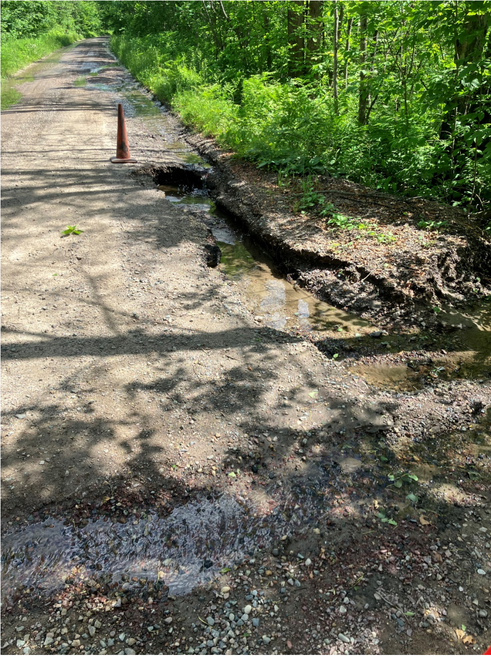
Forest County, Nicolet Trail Storm Damage – before repairs