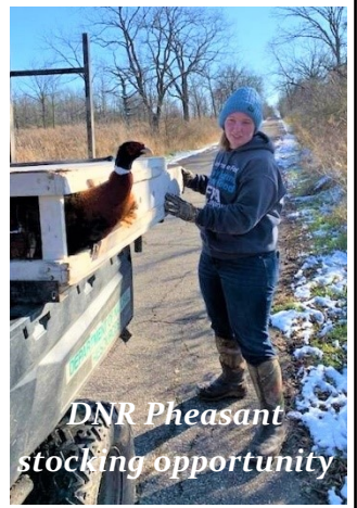
DNR Pheasant stocking opportunity